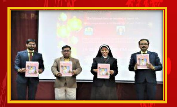
Release of Newsletter Luminous " Christ Jayanti" vol. 11.2.