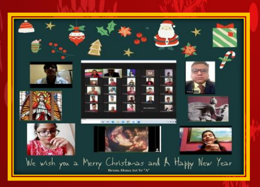
Class wise Christmas Celebration was conducted.