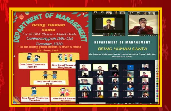
Being Human Santa Competition was conducted by Dept. of Management