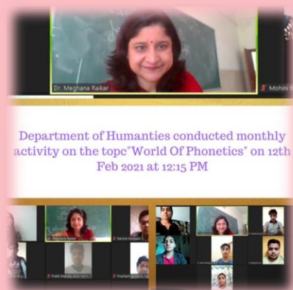
'World Of Phonetics' - Session by Dept. of Humanities