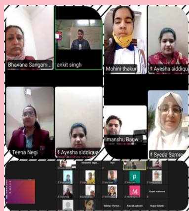
Guest lecture - Department of Computer Science