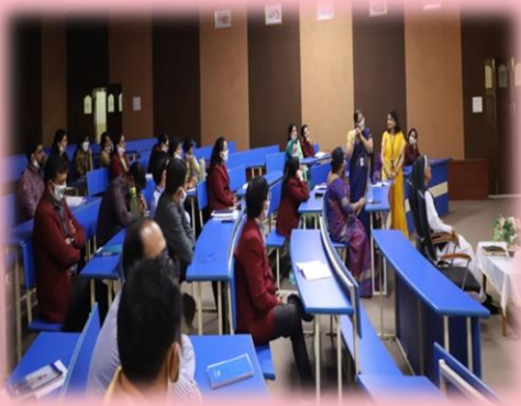
Faculty Enriching Faculty By Dept. of Humanities, titled - 'Human Relations and Values'