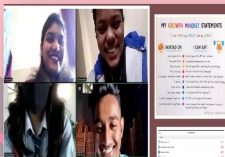
Phonetics Workshop Phase-2 by the Language Lab Committee