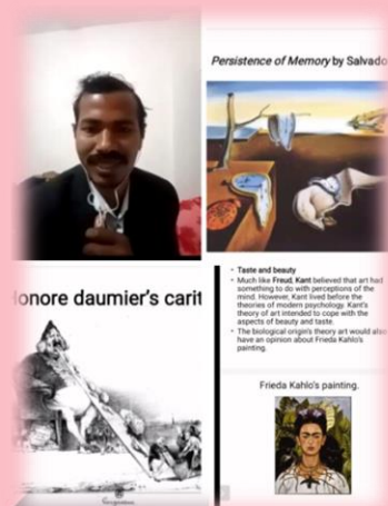
National Webinar - Dept. of Humanities Titled 'Psychological Benefits of therapy'