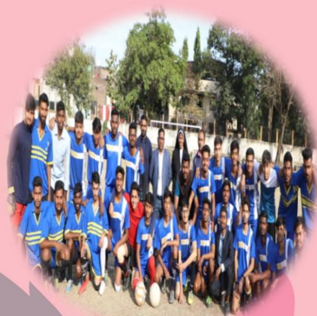
Practice Football Match