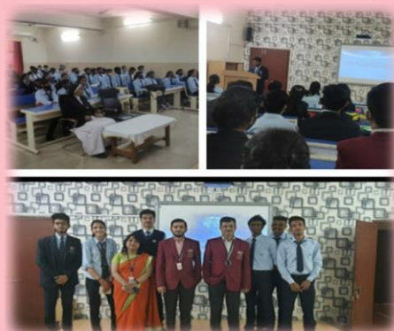
Science club activity - Topic- 'Exo Planet'