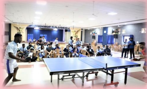
Inter-House Table Tennis Match - Boys & Girls