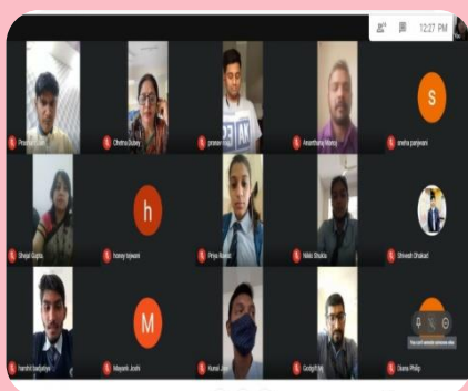
Debate Competition by Counselling & Tutorial Committee