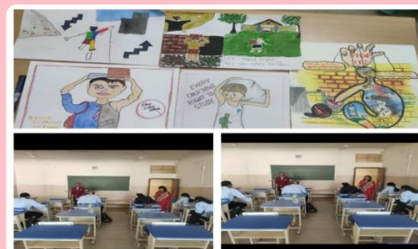
Drawing competition conducted by Women & Child Protection Committee