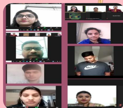
Elocution Competition - Gender Champions Club on Topic 'Feminism'