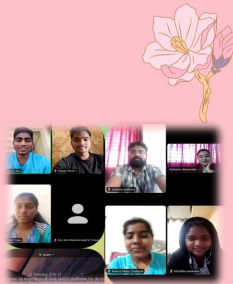
Mentor Interaction Session by Christian Students Association