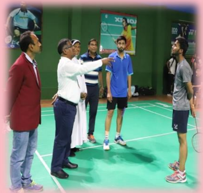
Inter-House Badminton Match - Boys & Girls