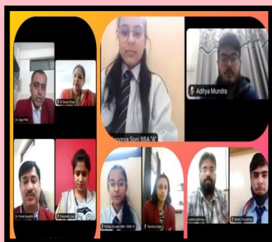
Debate Competition on the Topic - 'Farm Bill 2020' - Dept. of Management