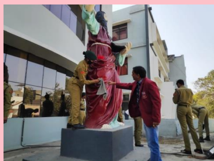
Cleanliness Drive by NCC - College campus and the Patron's statue of St. Paul