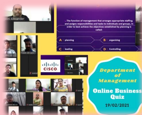
Online Business Quiz - Dept. of Management