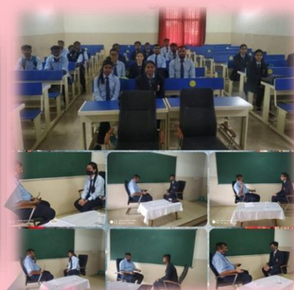
'Mock Interview Drive' by the CSDP Committee