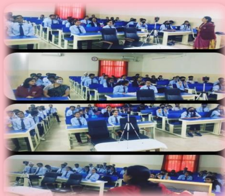
Fun Activity- 'Identifying The Phrases' - Dept. of Humanities