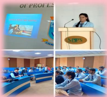
Workshop on 'Effective Reading' by library committee