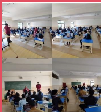
Language lab committee organized a session on Advertisement and short story