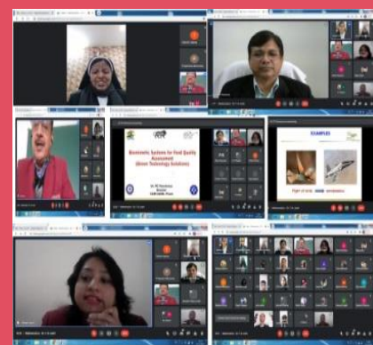
National webinar was conducted by the Dept. of Science