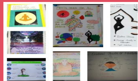
Counseling & tutorial committee organized Poster competition on the topic 'Impact of meditation on mental health'