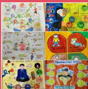
CCT committee has organized poster competition on- Managing exam stress