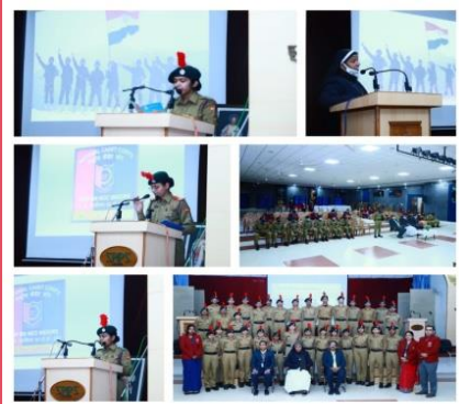
NCC committee celebrated Armed forces veteran day