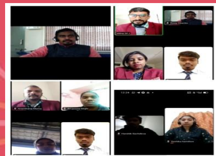
Guest Talk on How to overcome Screen addiction by Christian student association committee