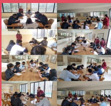
Library committee conducted a One word substitution quiz