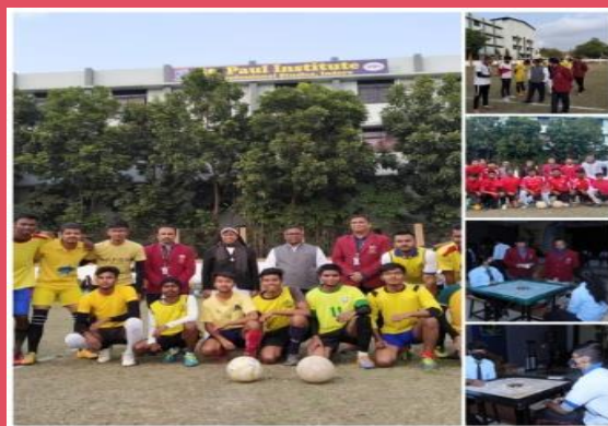
Sports committee organized Inter house football and Carom (Boys & Girls) tournaments