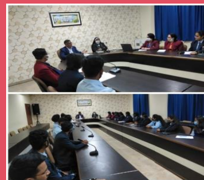
Student welfare committee organized a Meeting of CR's