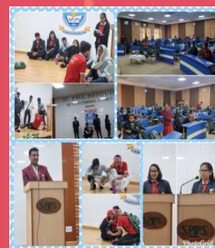
Dept. of Humanities conducted Art club activity