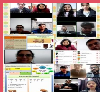
Music committee organized musical session on Taal