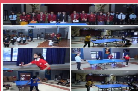
Sports Committee organized Inter House Table Tennis boys and girls tournament