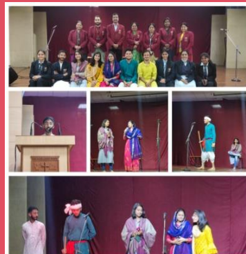
Dept. of Humanities performed Act play