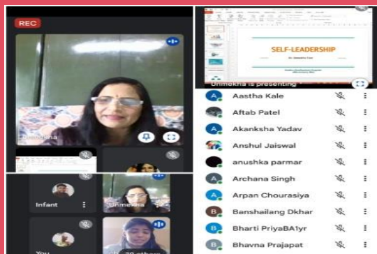
Student development program on Self leadership was conducted under the collaboration with RFI