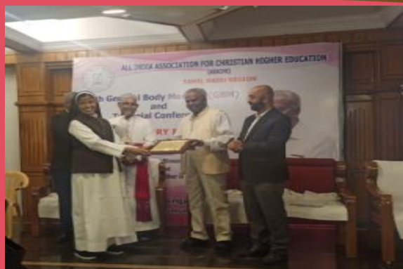
Best Principal award received by Sr. Principal at National Conference of All India Association for Christian Higher Education (AIACHE), at Kanyakumari