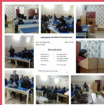
Session by Pre-university committee