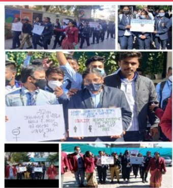
The Gender champions club organized an in-house rally on Gender awareness and equality