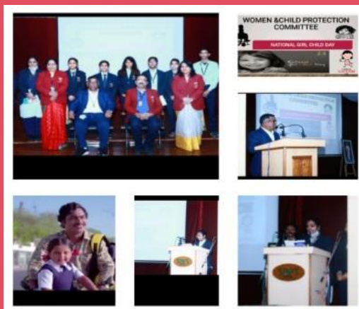
Celebration of National Girl Day in Morning assembly by Women & child protection committee