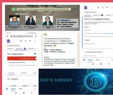
Dept. of Commerce organized Quiz on Crypto currency