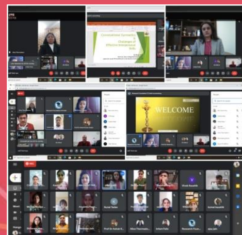
Student development program on Skills to build confidence was organized in collaboration with RFI