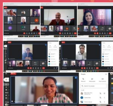
Student development program on Stage presentation skills was conducted in collaboration with RFI