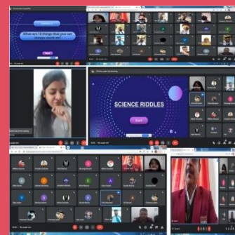
Dept. of Science conducted science club activity Science riddle