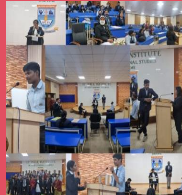
Student's mock court conducted by Dept. of Humanities