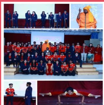
Youth week celebration by NSS Committee