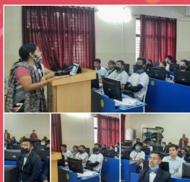
Dept. of Computer Science conducted workshop on Python programming methodology