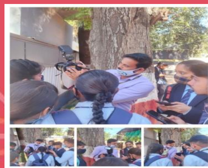
Photography and PowerPoint committee organized a hands-on workshop