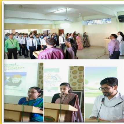
Library Committee conducted a program on World Book and Copyright Day