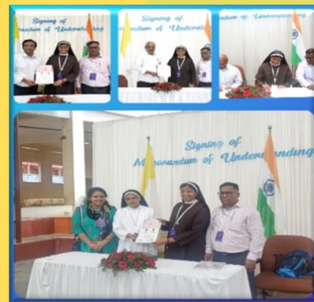
Director and Principal's visit to the 1 st National Academic Collaboration Meet, Kerala on 14/05 and 15/05/2022