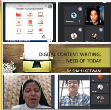
Research and Journal Committee conducted a faculty development program in collaboration with RFI from 17/05 to 21/05/2022