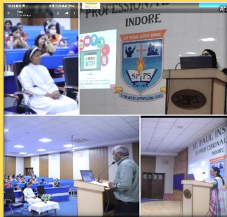
Inter-department FEF session by the Department of Computer Science on ' Cloud Computing and MOOC '