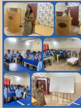
Gender champions club organized talk on 'Gender sensitivity'