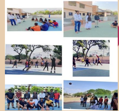
Sports Committee organized Basketball tournament