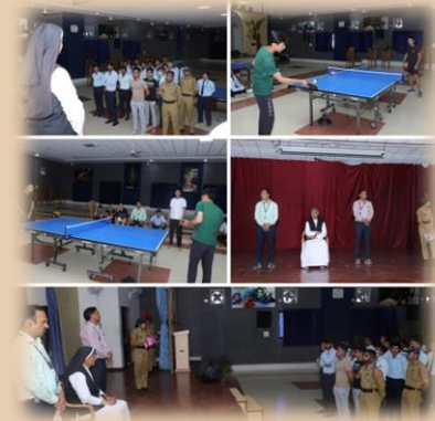
Sports Committee organized Table tennis tournament