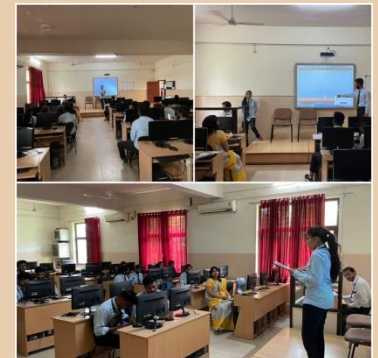
Science Club Activity by Department of Science