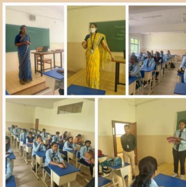
Department of Humanities conducted session on 'Adult Crisis'