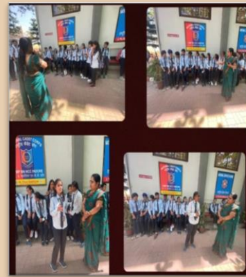
Department of Humanities conducted group discussion on 'Changing forms of feeling'