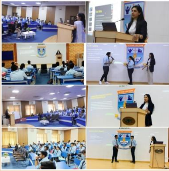
Department of Commerce organized invited talk on 'Industry readiness'