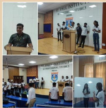
Department of Management organized session on 'Creative Management'