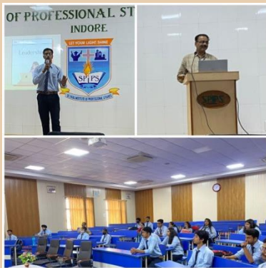
Session on Leadership, social interaction & modern v/s traditional values by class representatives conducted by Students welfare committee