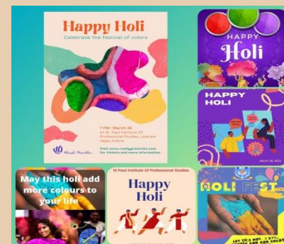
PowerPoint and Photography Committee organized an e- poster competition on 'Holi- Festival of Colours'