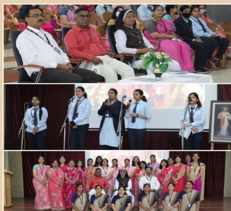
International Women's Day celebration by Women and child protection committee