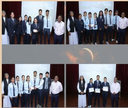
Felicitation of winners of Commerce Fiesta - 2022 and Inter stream business plan competition conducted by Department of Commerce