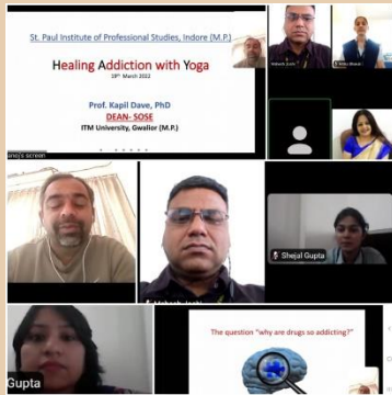
Counseling & tutorial committee organized Guest talk on 'Healing addiction with Yoga'