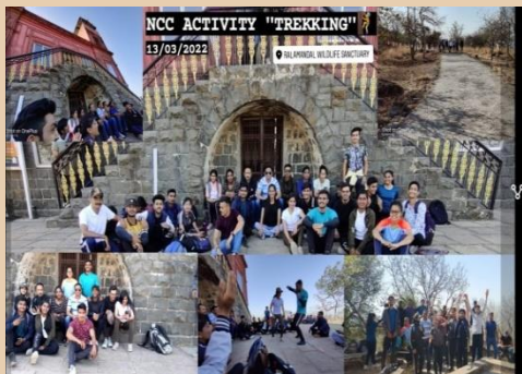
Trekking activity by NCC Cadets