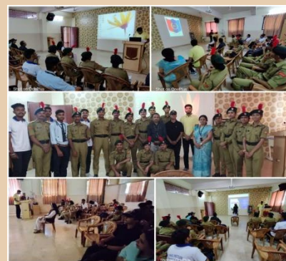
NCC Committee conducted session on 'Role of Youth in progress of Country' by passout NCC Cadets