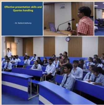
CSDP Committee organized session on 'Effective presentation skills & queries handling'