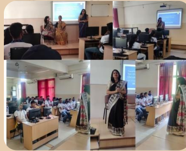
Department of Computer Science conducted session on 'Tips and tricks of group discussion'