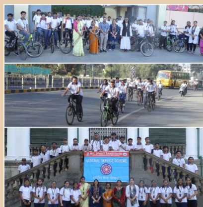
NSS committee organized Cyclothon