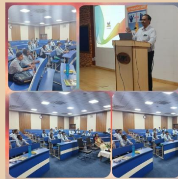
Internal Quality Assurance Cell organized guest lecture on 'Learning practical implications of Export-Import Management'