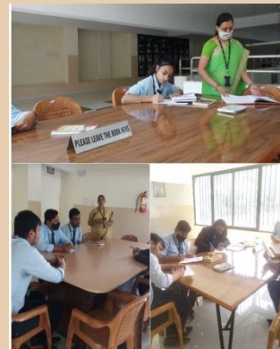
Book review competition conducted by Library committee