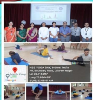
NSS Committee celebrated International Yoga Day