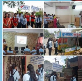
NSS Committee conducted a Voting Awareness Program at adopted village Ralamandal