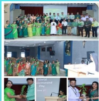
Environmental Club in association with NSS Committee celebrated World Environment Day