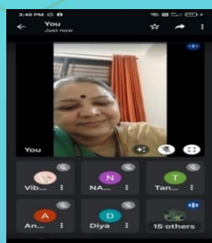
Language Lab Committee organized an online tutorial session on Competitive English