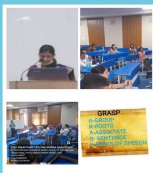
Department of Humanities conducted Faculty Enriching Faculty session titled 'From Memory to Retrieval'