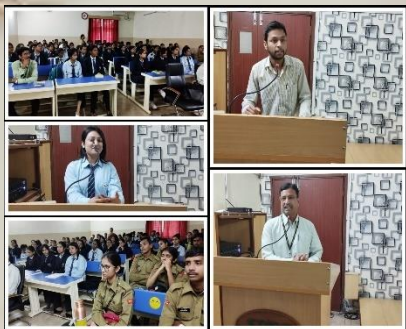
Guest talk on 'Implementation of Psychological Theories into Professional Practice' – Department of Humanities