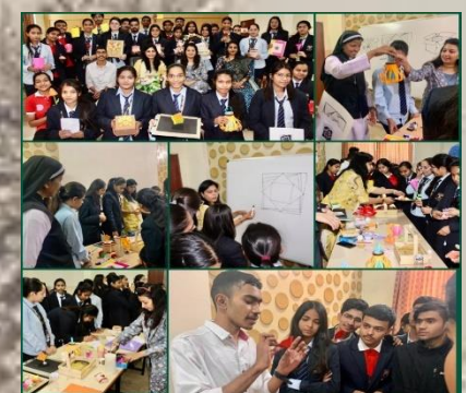
Display Board Committee organized an Art & Craft Workshop