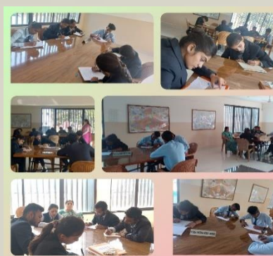
Essay Writing Competition on the topic 'Computers Replacing Teachers' – Department of Computer Science