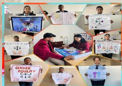
Poster Making Competition – Gender Champions Club