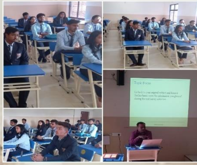
Department of Management conducted a session on 'How to Write a Research Paper?'