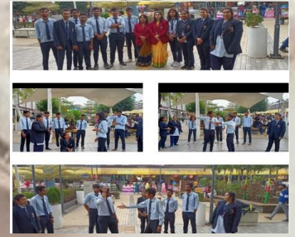
Nukkad Natak on 'Importance of Female Education' – Women & Child Protection Committee