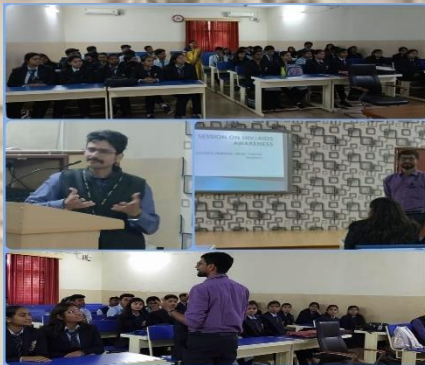
Session on HIV/AIDS Awareness by Publications Committee