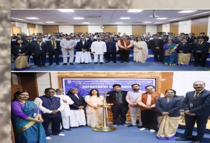
National Conference on Entrepreneurship and IPR Vision 2047, Problem, Challenges and Opportunities – Department of Commerce