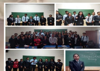
Counseling and Tutorial Committee organized a brain storming activity