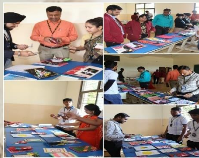
Sale of Christmas Cards prepared by the students – Students' Welfare Committee