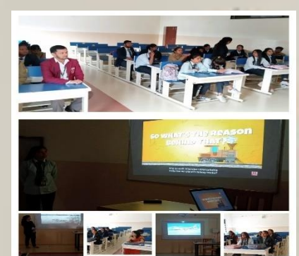
Science Club activity on 'Scope of Applied Sciences' – Department of Science