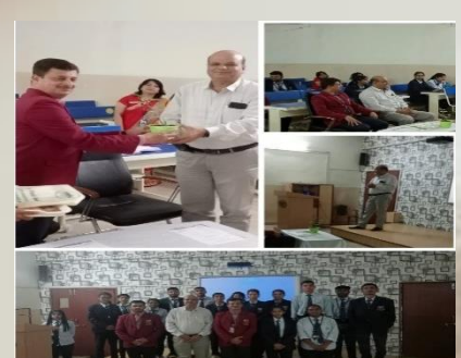
Guest talk on 'Career in Computer Hardware and Software' – Department of science