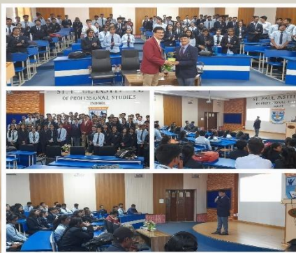
Invited talk on 'Careers in Stock and Equity Market' – Department of Management