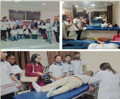
NSS & NCC Committee in association with St. Francis Hospital organized a Blood Donation Camp