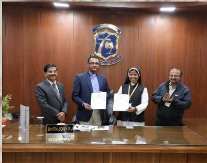
MoU signed between St. Paul Institute of Professional Studies, Indore and BSSS Institute of Advanced Studies, Bhopal