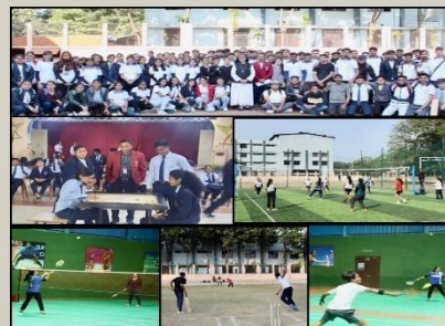
Sports Committee organized Inter-House Cricket, Volleyball, Badminton and Carrom Tournament (Boys/ Girls).