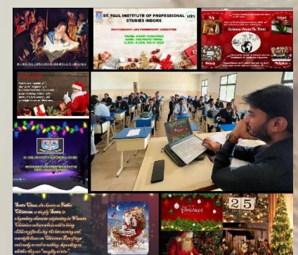
Photography & PowerPoint Committee conducted Christmas PPT Making Competition