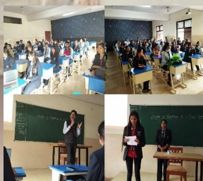
Department of Humanities organised a session on 'Career Options in Psychology'