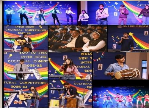
Inter-House Cultural competitions – Programme Committee