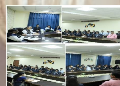
Meeting of Director and Principal with Class Representatives