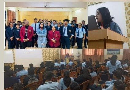
Alumni Talk on "Career Avenues in Blogging and Content Management" – E-care Committee and Website Committee