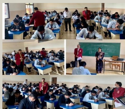
Department of Commerce conducted Commerce Quiz - Phase 1