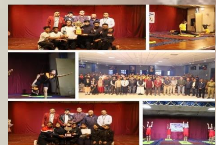
Inter College Yoga Competition (Men and Women) – Department of Physical Education