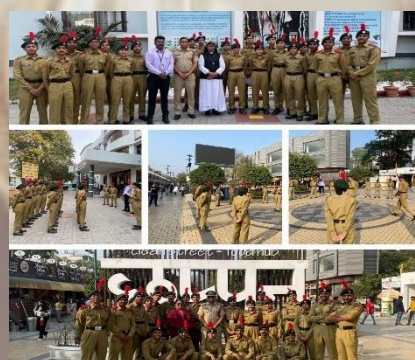
NCC Committee conducted Nukkad Natak on the occasion of World Aids Day