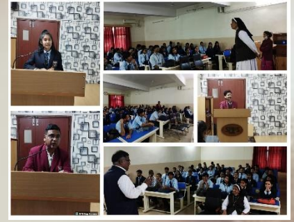
Counseling and Tutorial Committee organized a special session for hostlers