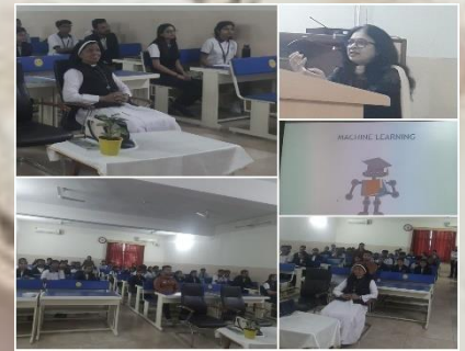
Guest lecture on 'Applications of Artificial Intelligence in Current Scenario' – Department of Computer Science