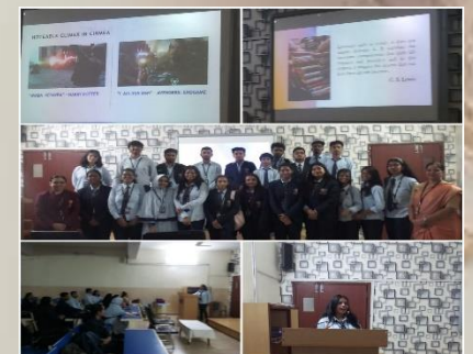
Discussion on Literary Terms by Library Committee