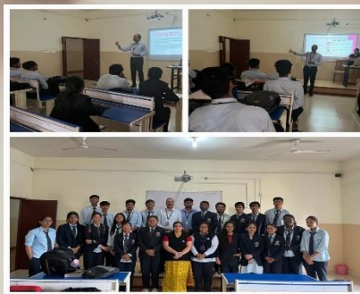
Research and Journal Committee conducted Research Methodology Workshop – Module 4