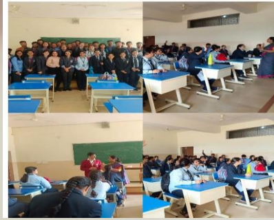
Language Lab Committee organized a session on 'Improve Your Vocabulary'