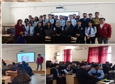
CSDP Committee conducted Inter-Departmental Business Quiz