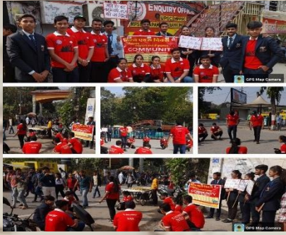
NSS Committee observed World AIDS Day