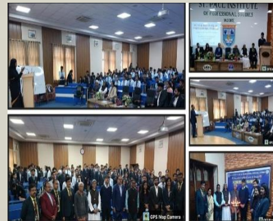
Department of Management organized a National seminar on the theme 'Ethics in Digitalized Era of Management and Entrepreneurship'