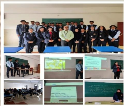
Environmental Awareness Committee conducted a PPT Presentation Competition on the topic 'Environmental Sensitivity'