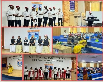
Music Committee along with Christian Students Association organized Carol Singing