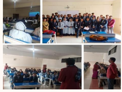
University Exam Committee conducted Activity for Advance Learners for Department of Humanities