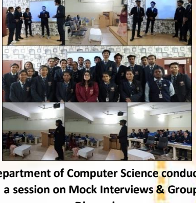
Department of Computer Science conducted a session on Mock Interviews & Group Discussion