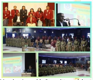
Morning Assembly Committee celebrated Makar Sankranti