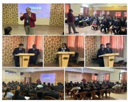
Research Paper Abstract Presentation - Research and Journal Committee