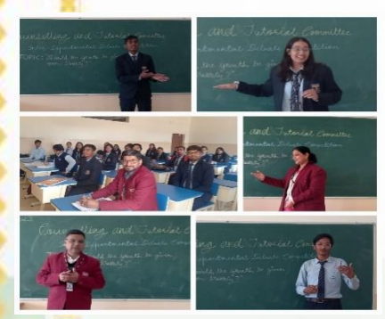
Inter-Department Debate Competition - Counselling & Tutorial Committee