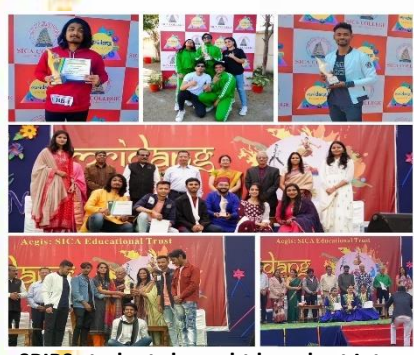
SPIPS students brought laurels at Inter-College Competitions at SICA college.