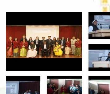
Commemoration of National Girl Child Day - Women & Child Protection Committee