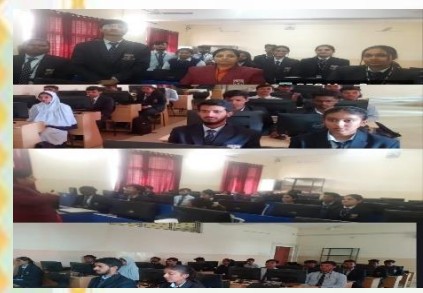
Department of Computer Science conducted ICT competency classes