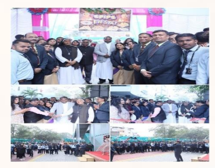
SPIPS Fiesta '23 - Department of Commerce