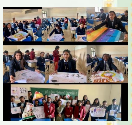
Display Board Committee organized a Drawing Competition for ALVIDA (Newsletter)