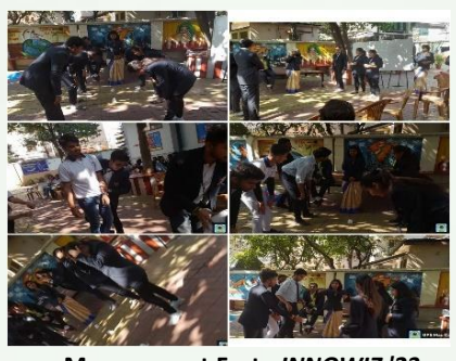
Management Fest - INNOWIZ '23 PHASE 2 - Business Games