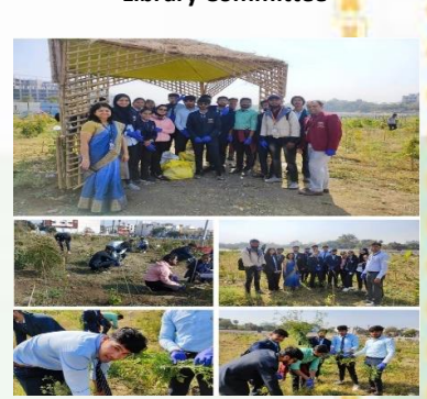
Environmental Awareness Committee conducted Cleanliness Drive beyond the Campus