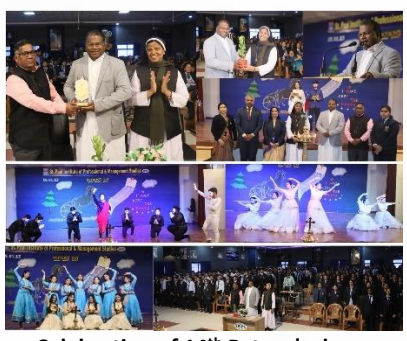
Celebration of 14th Patron's day - Programme Committee