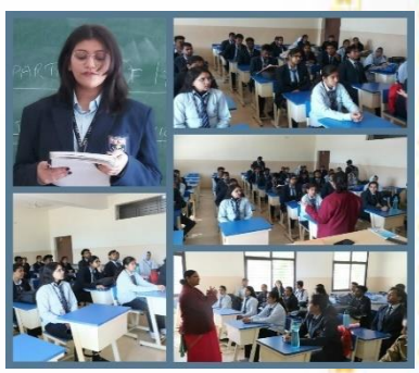
Workshop on Figures of speech by Library Committee