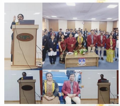
Invited Alumni Talk conducted by Department of Humanities