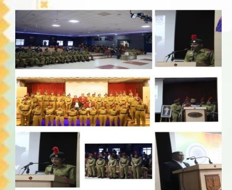
NCC Committee commemorate the National Indian Army Day