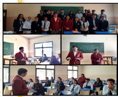
Session Vocabulary Building Techniques -Language Lab Committee