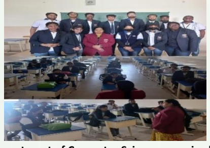
Department of Computer Science organised an Internal Research workshop