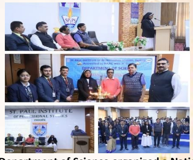
Department of Science organized a National Workshop on the theme 'Recent Trends in Research Methodology'