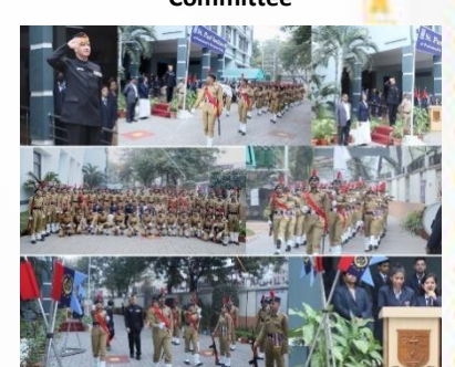
Flag hoisting and NCC parade to commemorate 74th Indian Republic Day