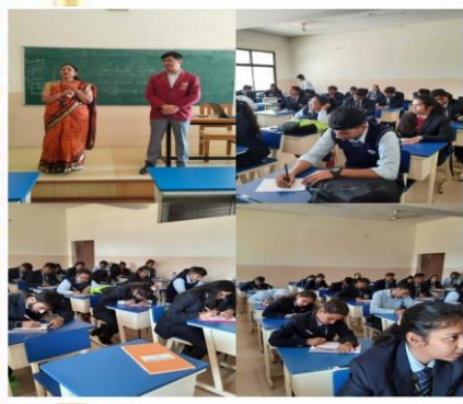
Language Lab Committee organised a session on 'Combating Stage Fear'