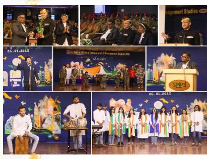
Republic Day Celebration - Programme Committee