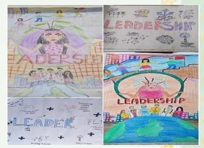
Task Based Activity for Class Representatives -Students Welfare Committee