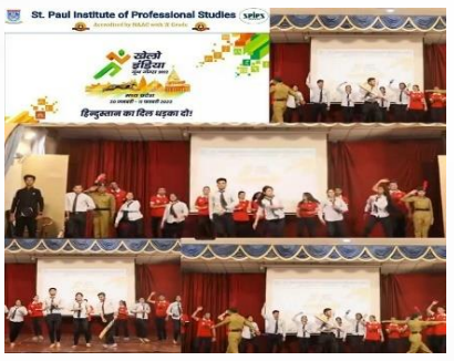
Performance by the students of St. Paul Institute of Professional Studies to promote 'Khelo India Campaign'