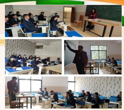
Department of Science organised Remedial Classes