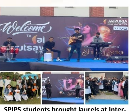
SPIPS students brought laurels at Inter-College Competitions at Jaipuriya college