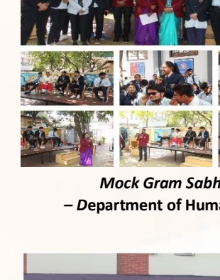
Mock Gram Sabha - Department of Humanities