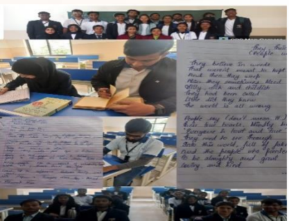
Department of Computer Science organised a Poetry Writing Competition