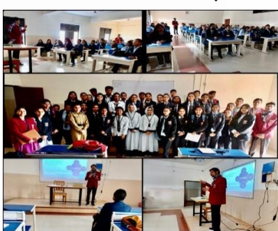
Department of Humanities organised a session on Career Guidance