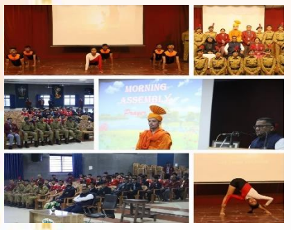
NCC Committee celebrated Youth Day