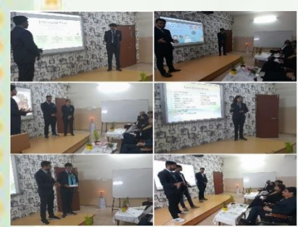
Management Fest - INNOWIZ '23 PHASE 1 - Shark tank