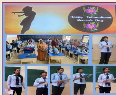
Department of Humanities anticipated Women's Day