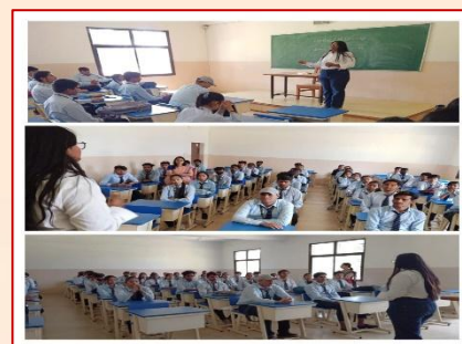
Advance & Slow Learner's Session - Department of Commerce