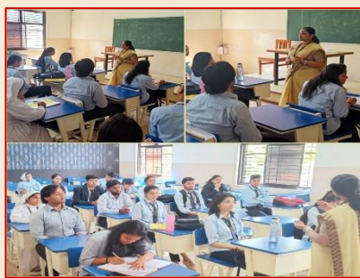
Publication Committee organized a Group Discussion on Nature Nurture