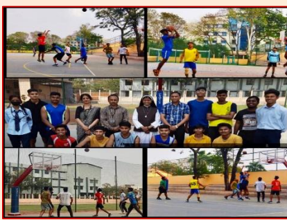
Sports Committee organized an Open Basketball Tournament for boys and girls