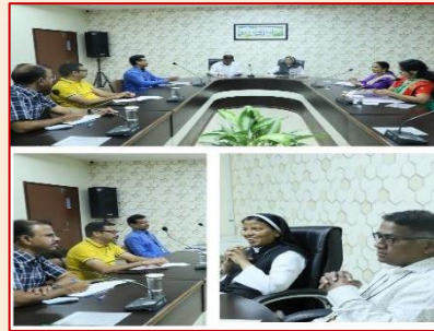
Executive Committee Meeting of Parents Professors Association