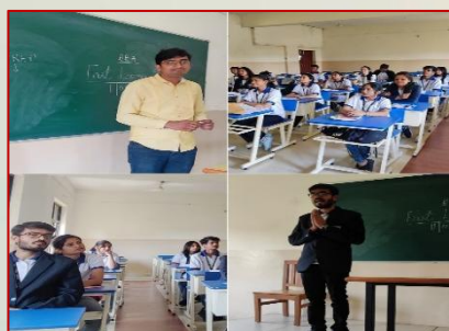
Alumnus interaction with fast learners - Department of Management