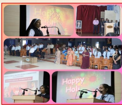
International Women's Day and Holi commemorated in the Morning Assembly