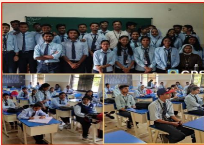
Discipline Committee conducted a session on Code of Conduct for students