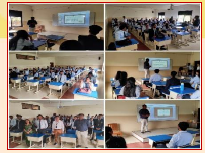
Session on Soft Skills For Successful Social Entrepreneur - Department of Management