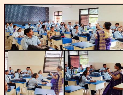
A session on World Classics taken by Department of Humanities