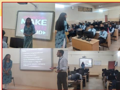
Motivational Session for aspiring rank holders of BCA by Department of Computer Science