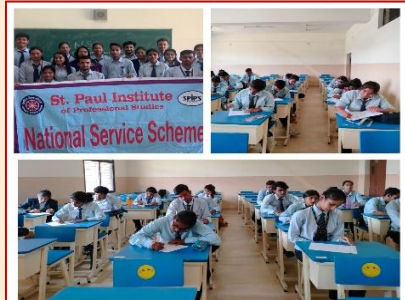
B-Certificate Exams for NSS volunteers - NSS Committee