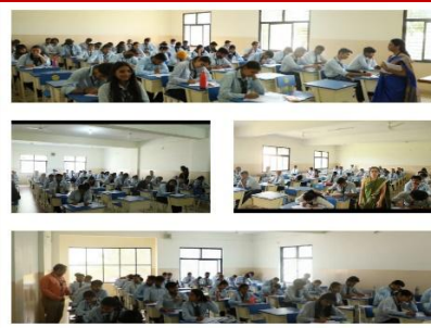
Pre-University Exams conducted for II Year Classes