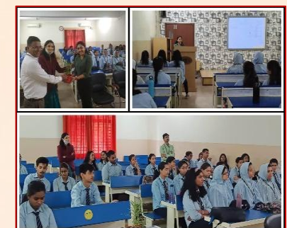
Counseling and Tutorial Committee organized a Guest talk