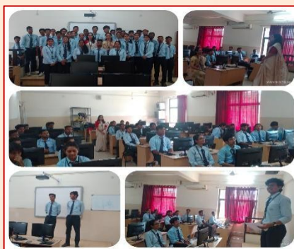
Discussion of Awareness about Cyberspace - IT Club Activity