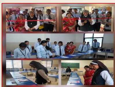
Display of Poems and Slogans - Gender Champions' Club