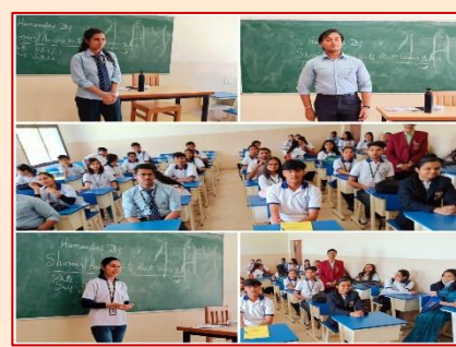
Sharing Amazing facts about various Authors - activity by Department of Humanities