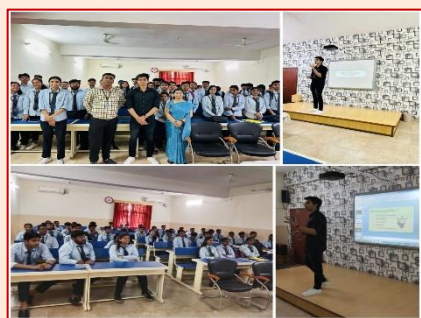
CCT Committee conducted Alumnus Interaction session