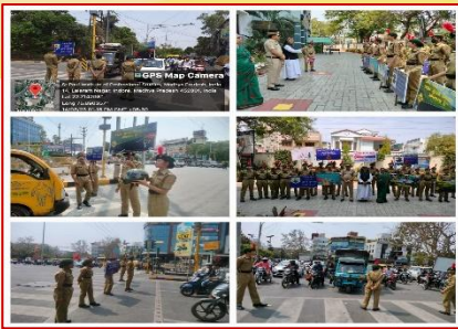
Traffic Awareness Program - NCC Committee