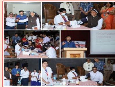
NSS Committee conducted Health Camp in association with Medanta Super Specialty Hospital