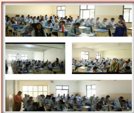
Pre-University Exam (for II Year Classes)