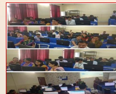
E-care Committee conducted a refresher session for faculty to update lecture plans