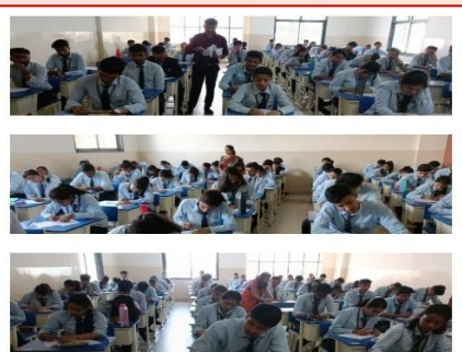
Pre-University Exams conducted for I Year Classes