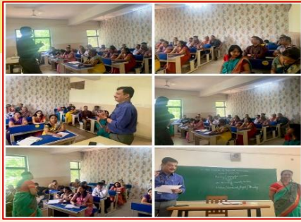
Orientation Session on External Viva Protocols - Practical Examination Committee