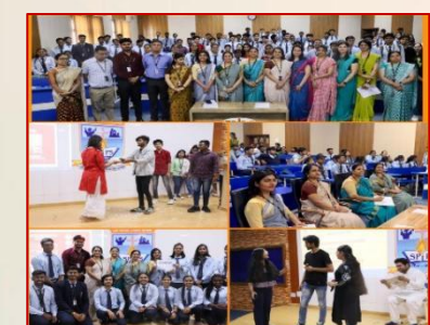
Ad Mad Show - Department of Commerce