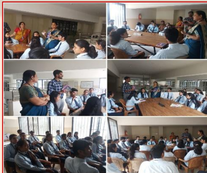
Book Review Competition by Library Committee