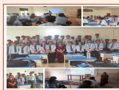
Department of Management organized a special session to promote Entrepreneurship