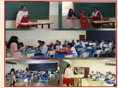
Alumnae Interaction on facing exam conducted as per the NEP - Library Committee