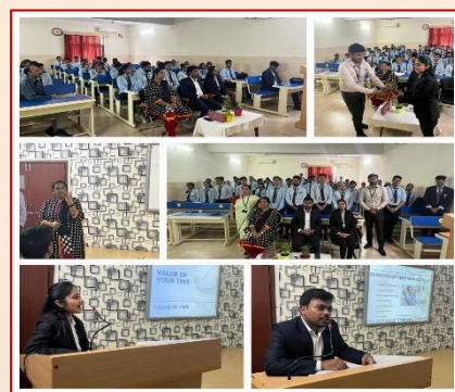
Alumni Interaction on 'Using Research to Fight Against Fake News' - Research and Journal Committee