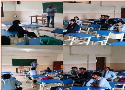
Motivational Session for slow learners - Department of Management