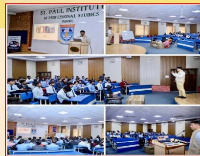
NISM Training Program - Placement and Entrepreneurship Cell