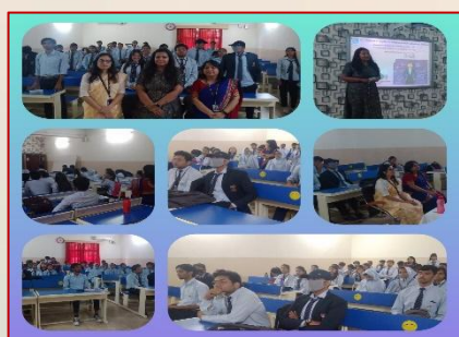
Women & Child Protection Committee organized an Alumnus Interaction