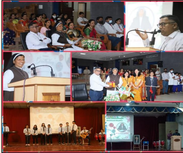
Celebrating Sister Principal's Birthday - Morning Assembly Committee, Programme Committee and Staff Association