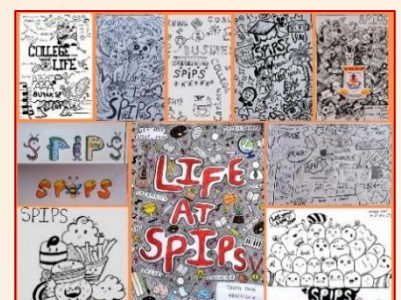
Display Board committee organized doodle making competition