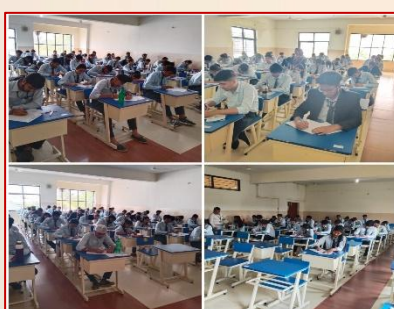
Common Class Tests for BBA and BCA VI semester