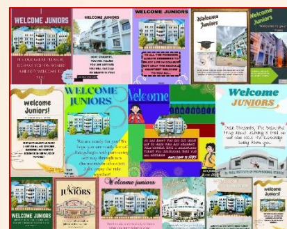
E-Poster Making Competition - Photography & PowerPoint Committee