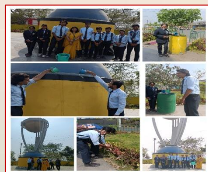
Environmental Awareness Committee conducted Cleanliness Drive