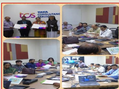
MoU signed with Tata Consultancy Services - Placement and Entrepreneurship Cell