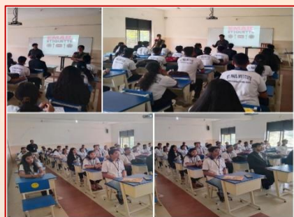
CSDP Committee conducted a session on Professional e-mail Etiquette