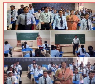
Language Lab Committee organized a session on Soft Skills, Voice and Narrative Skills