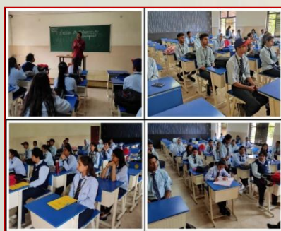
Department of Humanities organized a session on Entrepreneurship Development