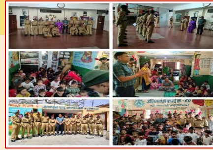
Distribution of stationery to needy students - NCC Committee conducted