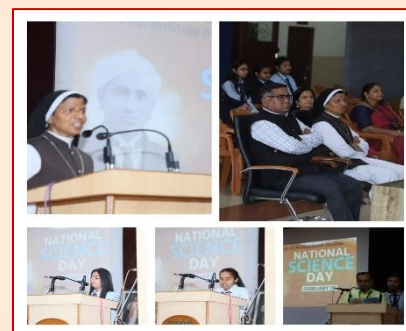
National Science Day commemorated in the Morning Assembly - Department of Science