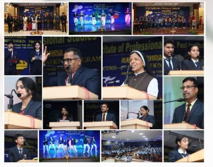
Welcome cum Orientation Programme for I Year students - Programme Committee