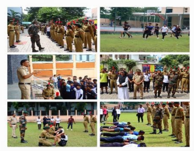
Physical fitness test for NCC selection -NCC Committee