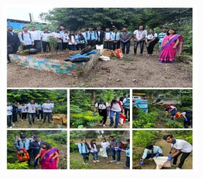
Environment Awareness Committee conducted a beyond campus activity