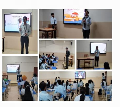
Counseling and Tutorial Committee organized a group counseling session for III Year students