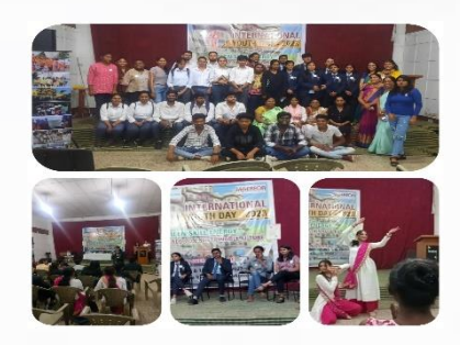
Celebration of International Youth Day – NSS Committee