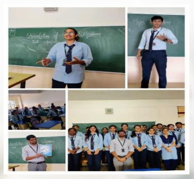
Orientation on Major Publications by Publication Committee