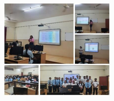
Department of Science conducted alumnus interaction session