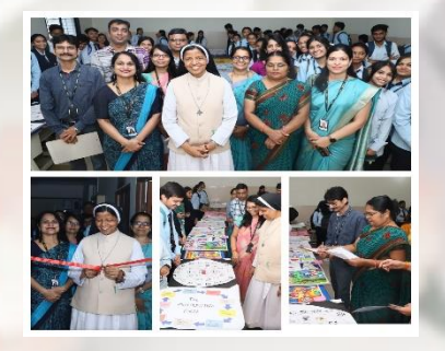
Department of Commerce organized Poster Exhibition cum Competition