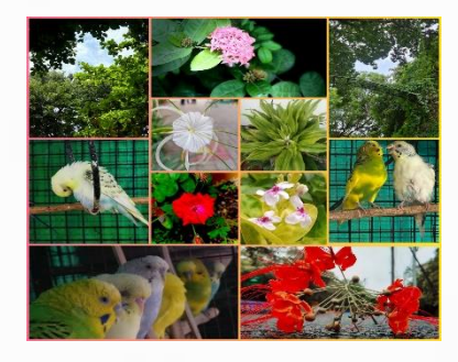
Photography competition on the theme Nature's Canvas - Photography and PowerPoint Committee