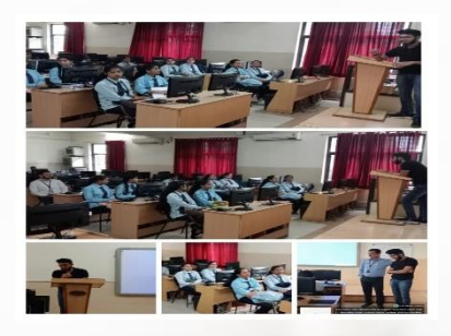
Department of Science conducted an alumnus interaction session