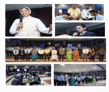
Sports Committee organized an Inter-house Chess Tournament