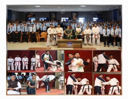
Gender Champions Club organized a Self Defense Workshop