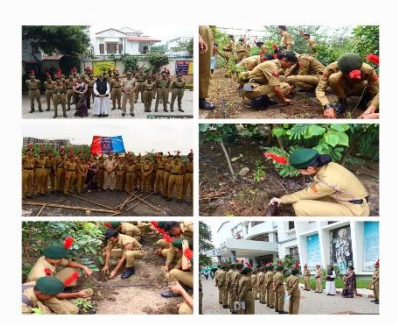
NSS Committee organized a plantation drive