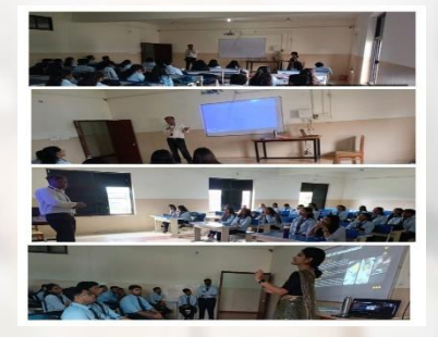
Department of Management conducted a session on 'Careers in Management'