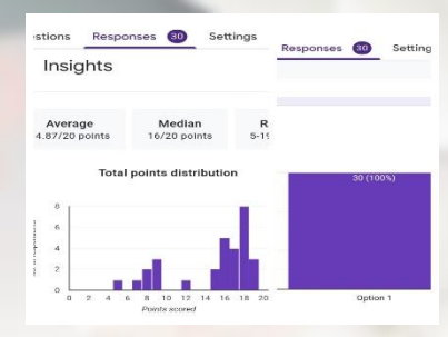
Department of Science conducted a GK quiz competition

Research Methodology Workshop on 'Application of MS Excel for Data Analysis' for Faculty Members - Research and Journal Committee