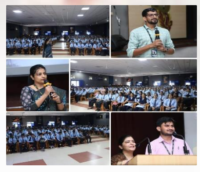
Programme Committee held an orientation meeting for I Year students