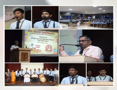
Morning Assembly Committee commemorated Onam and Raksha Bandhan