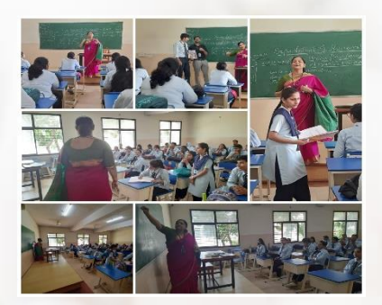
Department of Humanities conducted a session on Soft Skills Development