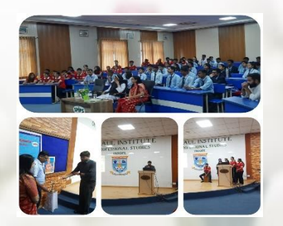
Orientation Session for the I Year students - NSS Committee