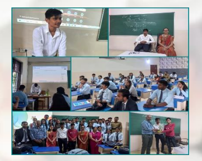
Department of Computer Science conducted an alumnus interaction session