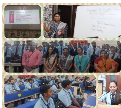
Research Methodology Workshop for BCA students - Department of Computer Science