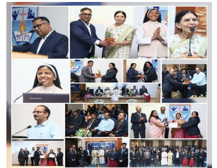
Department of Commerce - National Conference