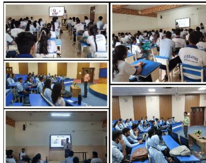
Group Counseling Sessions for 1 Years' - Counseling and Tutorial Committee