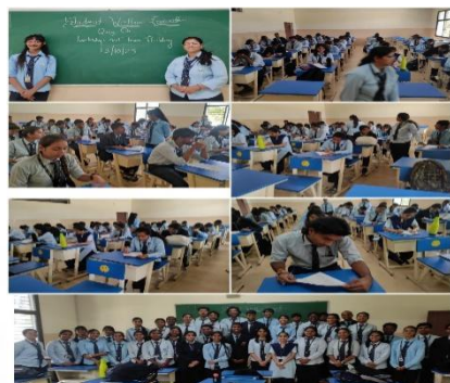
Student Welfare Committee conducted a quiz on team building and leadership