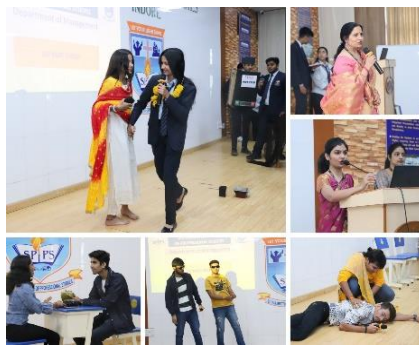
Ad Mad Show (Screening Round) - Department of Management