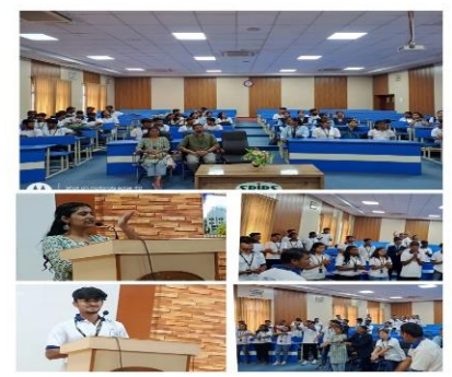
Alumni Guest Talk - Christian Students Association