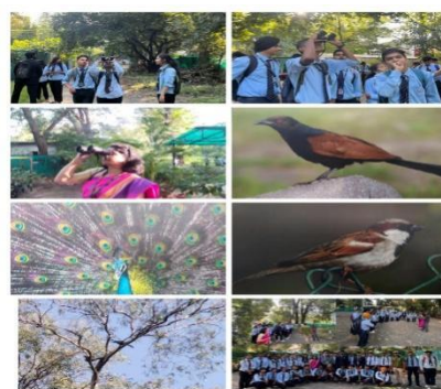
Environmental Awareness Committee celebrated National Wildlife Week - organized Bird Watching Activity