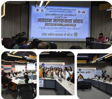
NSS representative at the meeting for voting awareness headed by Indore Commissioner