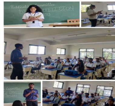
Poetry recitation competition by Publication Committee