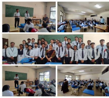
Group Discussion on 'soft skills required to success in social media' - Language Lab Committee