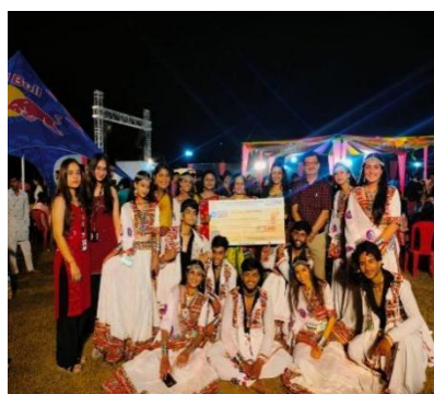
SPIPS bagged 1 Position at the Inter-college Garba Competition