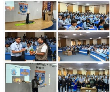
Guest talk on 'Yoga for healthy body and healthy mind' - Physical Education Department