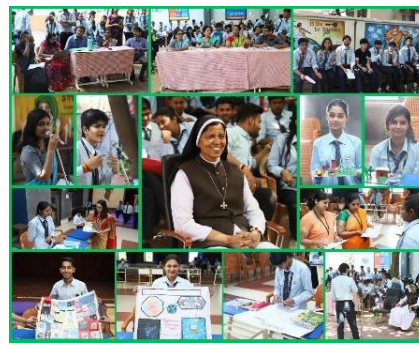
Inter-house art and literary competitions - Programme Committee