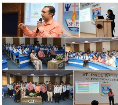
Dept of Commerce organized an Invited Talk on Career Guidance