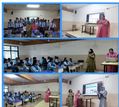
Session on Average and Slow learners by PUE Committee for Department of Computer Science