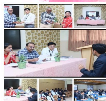
Selection interviews for the Internship Program of the Website Committee