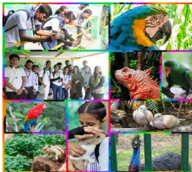
Wildlife Photography Trip to Indore Zoo - Photography & PowerPoint Committee