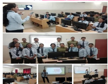
Department of Science conducted Science club activity on 'Science Riddles'