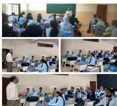
Research and Journal Committee conducted RM Workshop Module B