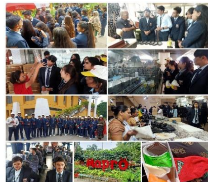
Industrial Exposure Tour (Pune- Imagica- Lonawala)