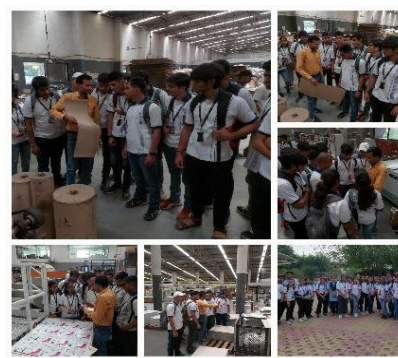
Industrial Visit to Rani Press Private limited