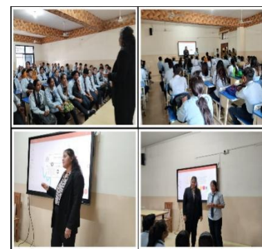
Department of Humanities conducted a alumni talk on 'Career Guidance'