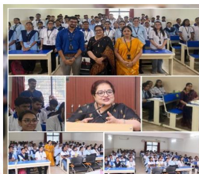
Guest Talk organized by Department of Humanities