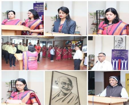
Gandhi Jayanti celebration during the Morning Assembly