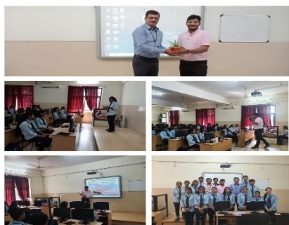
Guest talk on 'Career Guidance in the field of Science' - Department of Science