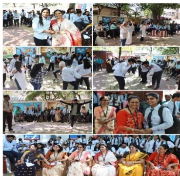
Dance Dhamaka - 2 for BA classes - Music and Dance Club