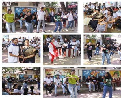
Dance Dhamaka - 2 for BBA classes organised by Music and Dance Club