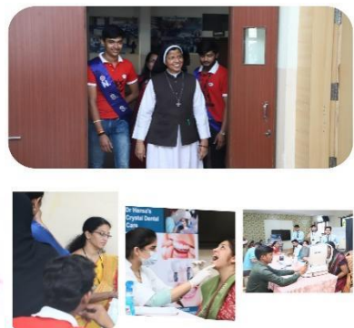
Health Camp organized by NSS Committee for Parents, Faculty & Staff