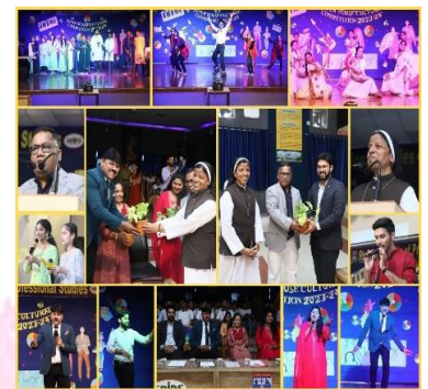
Grand Finale of Inter-house cultural competitions - Programme Committee