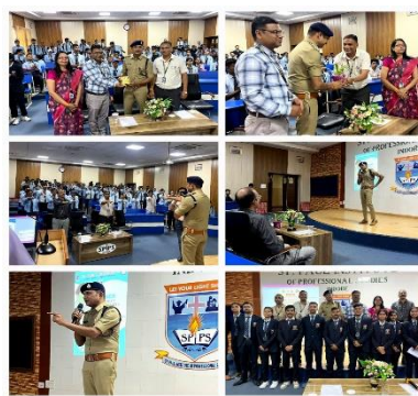
NCC & NSS Committee organized a Guest Talk on 'Cyber Security'