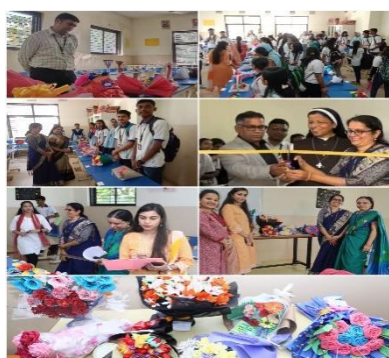
Handmade Bouquet Exhibition cum Competition - Display Board Committee