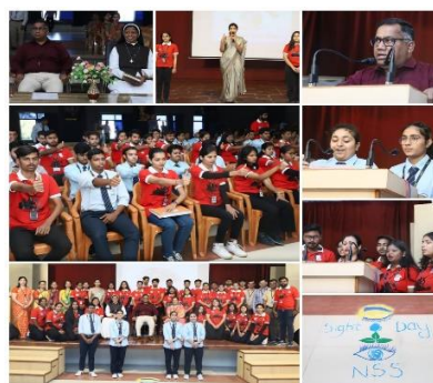
World Sight Day celebrated by NSS Committee in association with the by Morning Assembly Committee