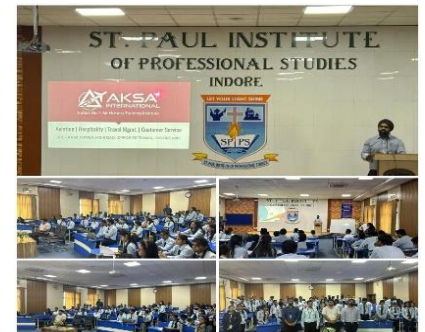
Session on 'In demand jobs for future' - CSDP Committee