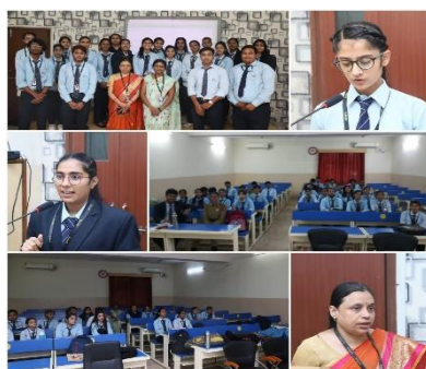
Workshop on the use of N-list (digital library) - Library Committee