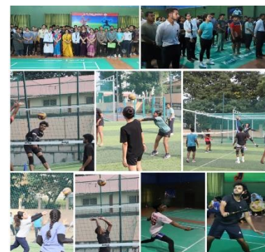
Sports Committee organized Inter-house Badminton and Volleyball Boys & Girls Tournament