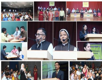
Annual General Body Meeting of Parents Professor Association