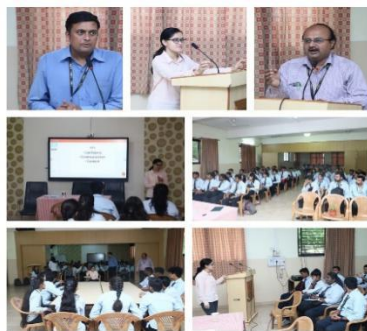
Mock Interview Session by Placement and Entrepreneurship Cell