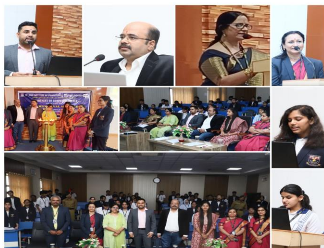
Department of Computer Science conducted an International Seminar on Recent Trends and Innovation in Technology, Science and Entrepreneurship