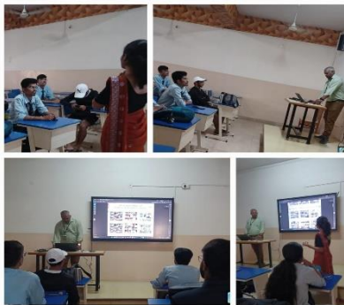
Training Session cum Follow up - Internship by Website Committee