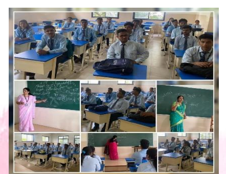
Department of Humanities conducted Hindi remedial classes