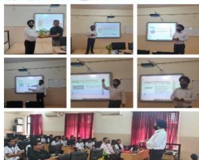
Guest talk on 'Career Guidance in the field of Mathematics' - Department of Science