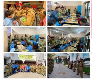
NCC Committee commemorated World sight day by a visit to Blind School