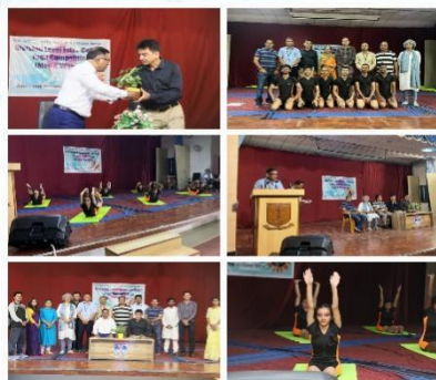
Physical Education Department organized Divisional level Inter-Collegiate Yoga Competition