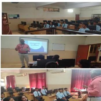
Orientation of the first batch of selected interns for the Website Committee Internship Program