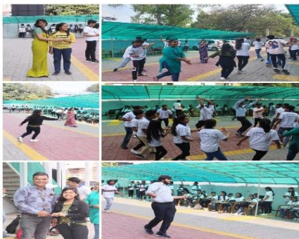
Dance Dhamaka - 2 for B.Com classes organised by Music and Dance Club