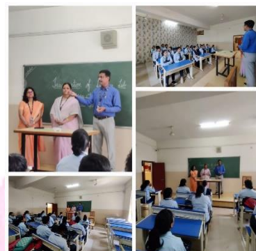
Language Lab Committee inaugurated the Language Club