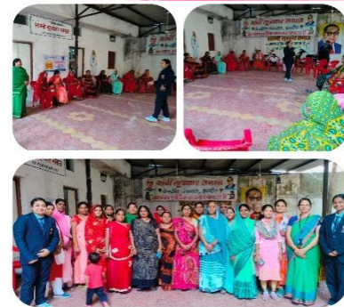
Women & Child Protection Committee organized a Session on Women Health and Hygiene at Samaan Society community