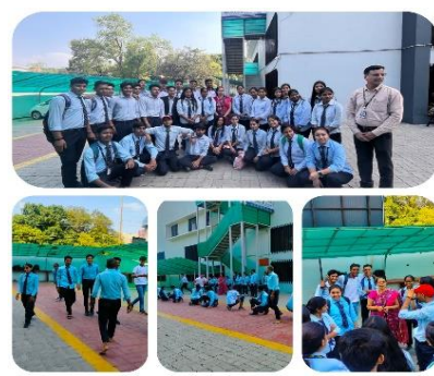
Discipline Committee organized a Team Building Activity