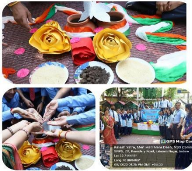
Kalash Yatra under 'Meri Matti Mera Desh' initiative