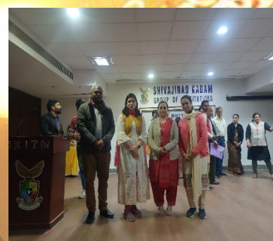
Faculty members attended Faculty development workshop on NPTEL awareness