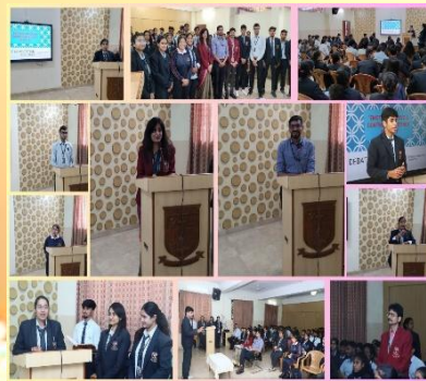
Counseling and Tutorial Committee organized a debate competition