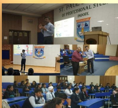
Placement & Entrepreneurship Cell organized a mentoring session on Entrepreneurship