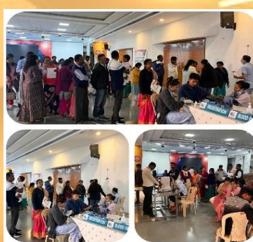
NSS, Peace Chair Committee & Rotary Club Adarsh in association with Apollo Hospital Indore organized a free health camp at St. Vincent Pallotti School