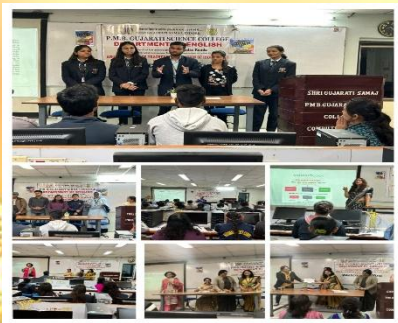
Communication Skills and PD Certificate Workshop attended by the students of Department of Humanities