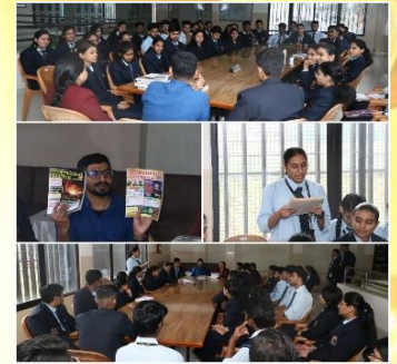
Session on competitive exam reparation through library by Library Committee