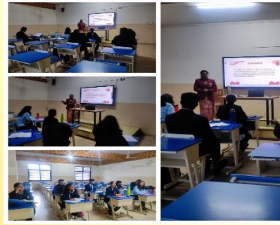
Research and Journal Committee conducted RM Workshop Module 4