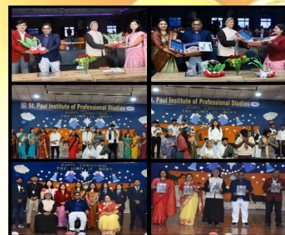
Christmas celebration by Morning Assembly Committee, CSA & Programme Committee