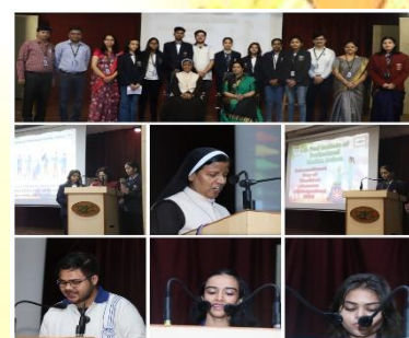
International Day of Disabled Persons commemorated in the morning assembly