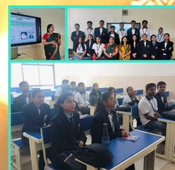
PUE COMMITTEE organized a session for advanced and slow learner