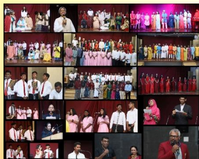
Programme Committee & CSA organized Carol singing competition – Preliminary round