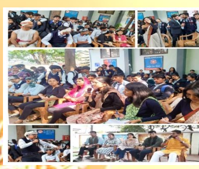
Mock Gram Sabha by the Department of Humanities