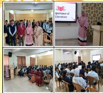
Department of Humanities organized an alumni talk on Career options in the field of linguistics