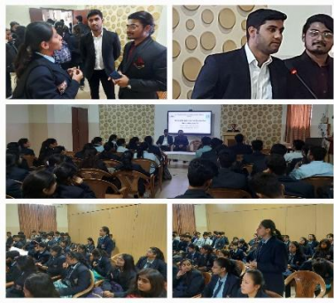
Research and Journal Committee organized an alumni interaction session