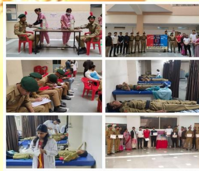
NSS (Red Ribbon Club), NCC Committee in association with St. Francis Hospital organized a blood donation camp