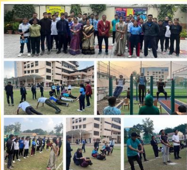
NCC committee conducted Physical fitness Test for NCC Cadets