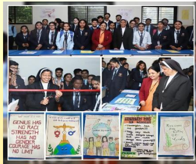
Gender Champions' Club organized a poster exhibition on Unveiling Equality