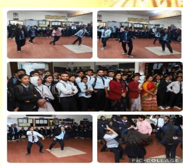
Dance Dhamaka -III - Music and Dance Committee