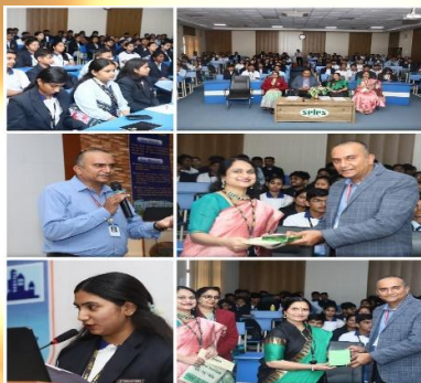
Department of Commerce organized a Workshop on e-filing of Driving License and Passport