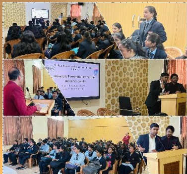
University exam committee conducted an alumni interaction session