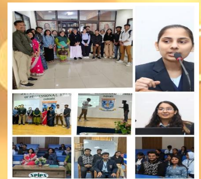
Department of Social Sciences conducted a group discussion activity, under MoU