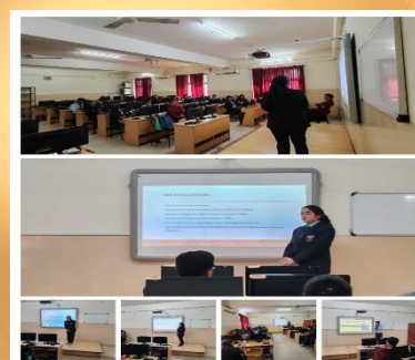
Department of Science conducted Science club activity PPT presentation on Scientists and their inventions