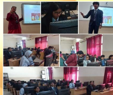
Department of Computer Science conducted final phase of coding competition TCORTE 23-24