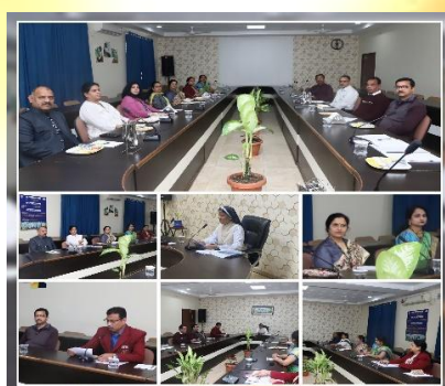
Parents Professors Association conducted the executive committee meeting