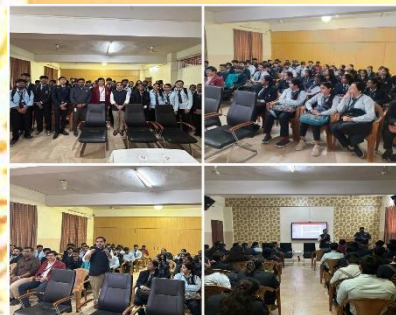
CSDP Committee conducted a session on Career Guidance for all II & III year classes