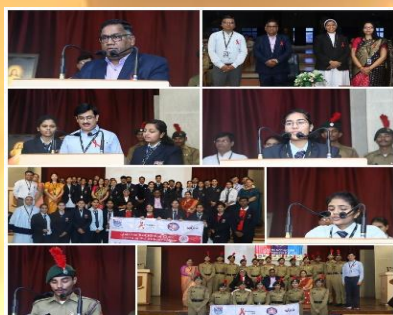
World's AIDS Day observed by NSS, NCC & Morning Assembly