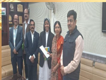
Principal receiving autonomous letter for SPIPS