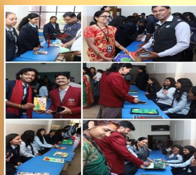
Display Board Committee and Students Welfare Committee conducted Christmas card exhibition cum sale