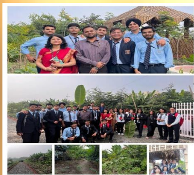
Environment Awareness Committee visited Ahilya Van