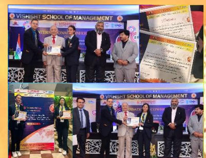
Students presented research paper at the 10th International Conference hosted by Vishisht School of Management (VSOM), Indore