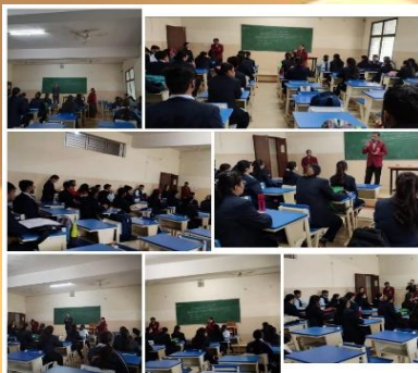
Language Lab Committee organized a workshop on e-mail and virtual communication