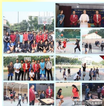
Sports Committee organized Inter-house basketball and carom tournament