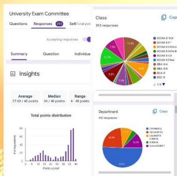
University Exam Committee conducted an e-quiz based on general awareness