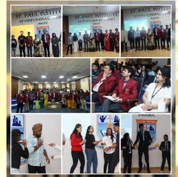
Department of Commerce organized an Ad-mad Show