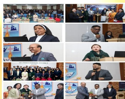
Department of Management organized an International Conference