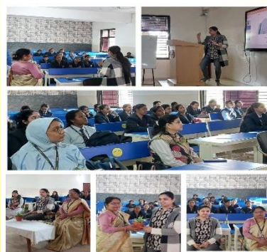
Women & Child Protection Committee and Anti-sexual Harassment Committee organized a workshop on Health & ...