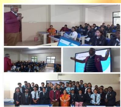
E-care Committee conducted a session on Modern Era of ICT Tools