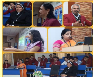
Department of Science and Computer science conducted Inter-departmental FEF