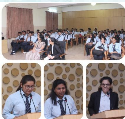
Department of Commerce organized an Alumni session on the topic 'Scope for Students in the field of Law'