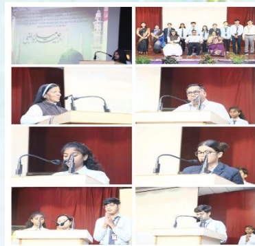
Commemoration of Eid Milad un Nabi - Morning Assembly Committee