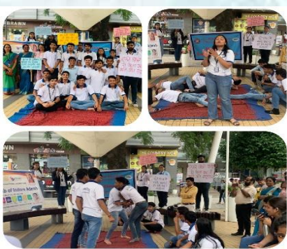
NSS Committee in association with Rotary Club Adarsh performed Nukkad Natak at Chappan Dukan, Indore