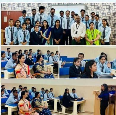
Department of Computer Science conducted an Alumni session