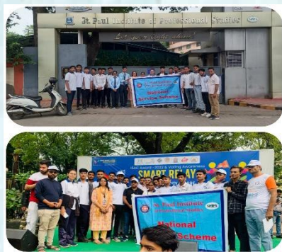
NSS Committee participated in Smart Relay organized for the promotion of ISAC award & Voting Awareness by state administration