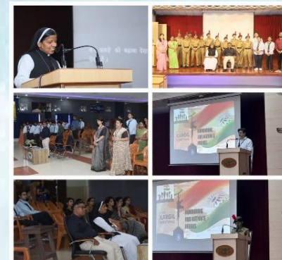
Kargil Vijay Diwas commemorated during the morning assembly by NCC Committee