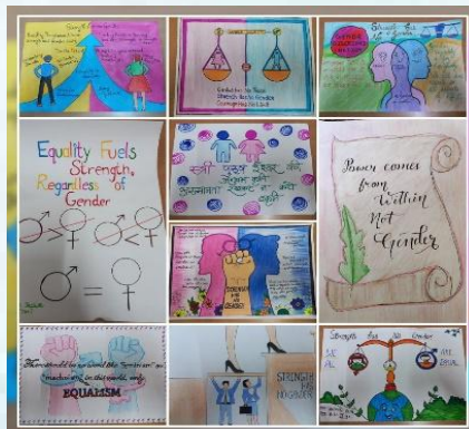
Creative slogan writing competition - Gender Champions' Club