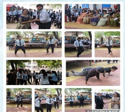
Music and Dance Club organized Dance Dhamaka for all B.Com classes