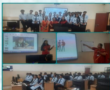
Session on ICT by e-care Committee & Department of Computer Science