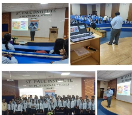
Career and Skills Development Committee conducted a session on 'Communication and Effective Presentation Skills'