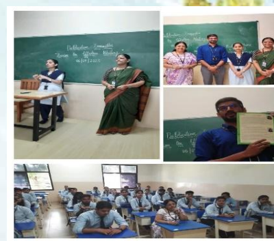
Session on Effective Writing by Publication Committee