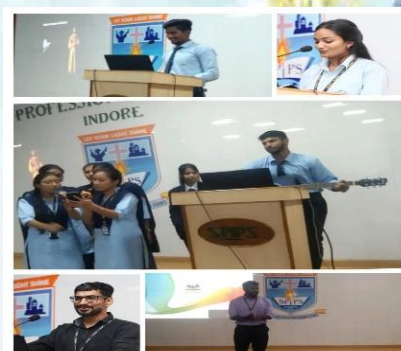
A Students Led session on the Life of St. Francis of Assisi organized by the Christian Students Association