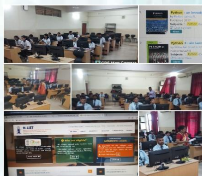
Workshop on N-list for II and III Year students