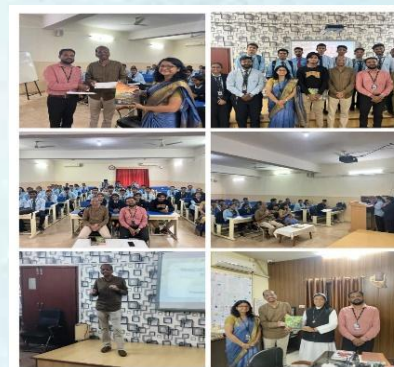
Guest Talk on 'Bird Watching' - conducted by the Environmental Awareness Committee