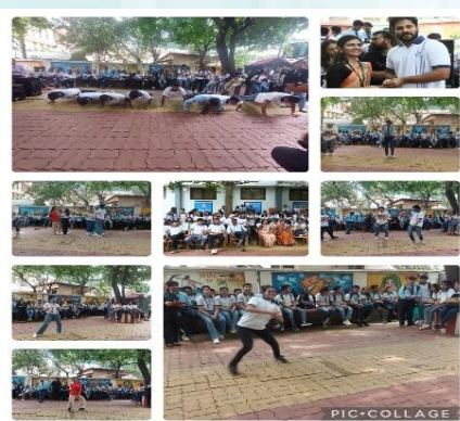
Music and Dance Club organized Dhamaka for all BBA classes