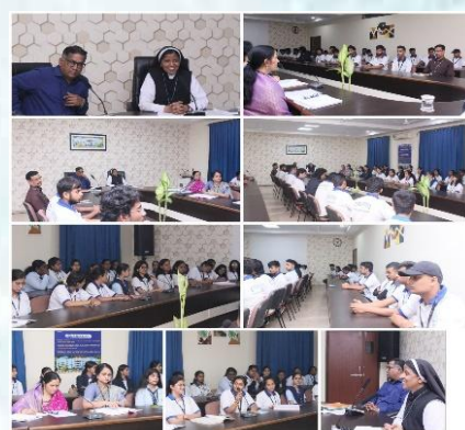
Special Meeting of Class Representatives with the Director and the Principal - Student Welfare Committee