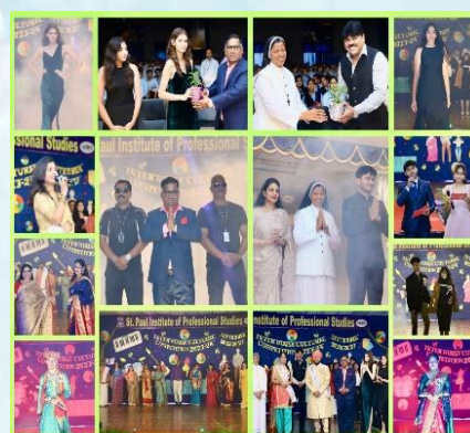
Traditional & corporate fashion walk competition - Programme Committee