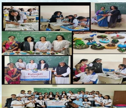
The Display Board Committee organized a Stone Art Workshop