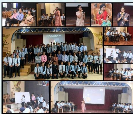
Department of Management conducted Management Quiz Competition