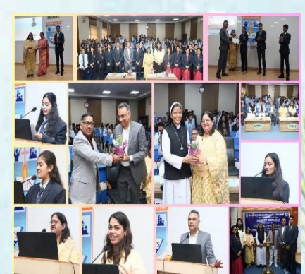
Department of Humanities organized a National Conference