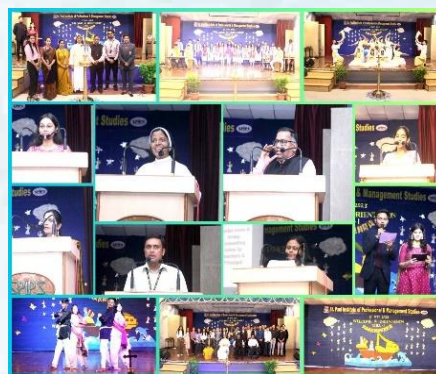
Welcome cum Orientation Programme for MBA I Year (2023) - Programme Committee