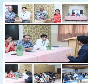
Selection interviews conducted for the internship program of Website Committee