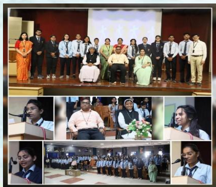
Department of Humanities commemorated Hindi Diwas