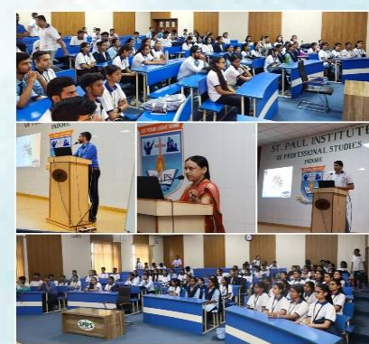
Session on 'Best Use of Your Library' by Library Committee