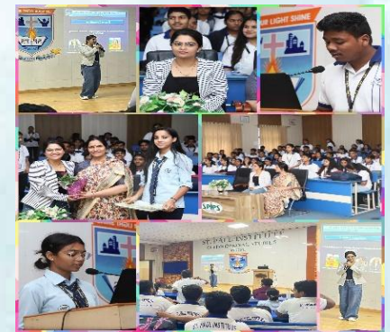
e-care Committee organized an Alumni talk on 'Social Media Impact on Marketing Strategies & Influence Marketing'