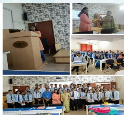
Women & Child Protection Committee organized an Alumni interaction session