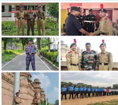
NCC Cadets attended Army attachment Camp at Gwalior organized by 7 Madras Regiment