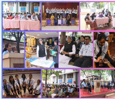
Inter-house Art & Literary Competitions - Day 2