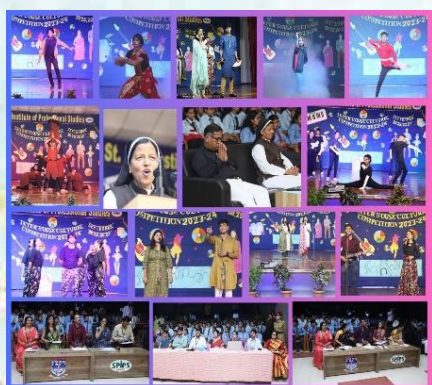
Programme Committee organized Inter-house cultural events - Day 3