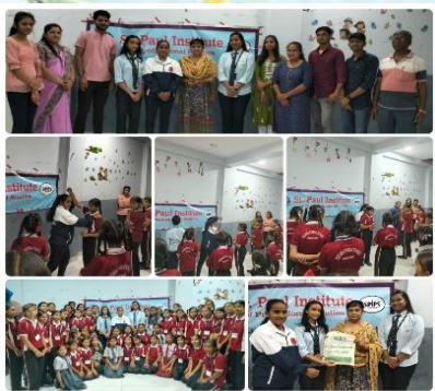
Women & Child Protection Committee and Anti-sexual Harassment Committee organized Smart Girl Workshop beyond campus