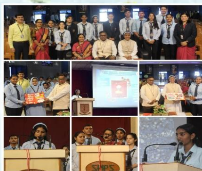
Teachers' Day celebration during the morning assembly