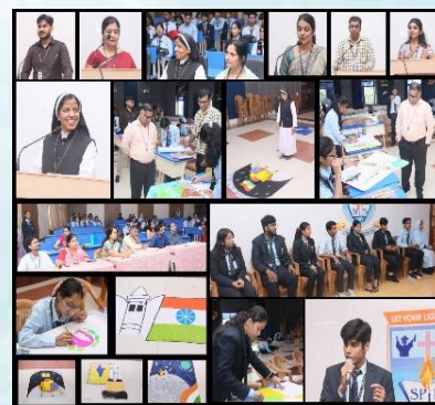
Programme Committee inaugurated Inter-house Art & Literary Competitions