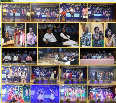
Programme Committee organized Inter-house cultural events - Day 3