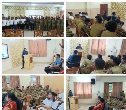
Alumni interaction on the topic of 'Career Opportunities For NCC Cadets' - NCC Committee