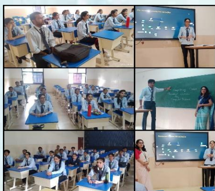
Remedial Classes - Department of Computer Science