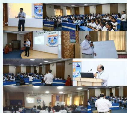
Placement and Entrepreneurship Cell conducted an orientation session ARJAN for all I Year students