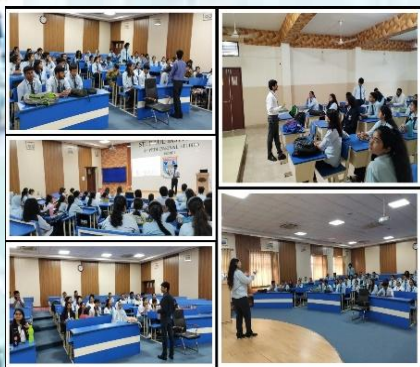
Counseling and Tutorial Committee organized 3 days Group Counseling sessions for all II Year and BBA-BCA III Year students