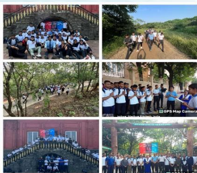
Trekking at Ralamandal wildlife sanctuary - NCC Committee