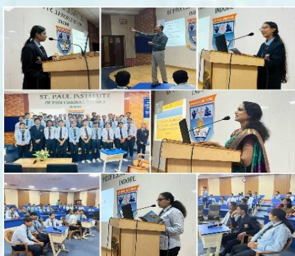
Department of Commerce organized Commerce Quiz