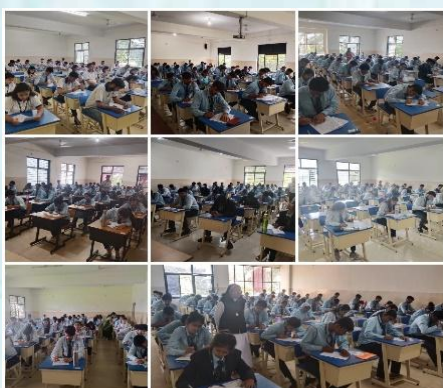
Common Class Test - 1 for all classes