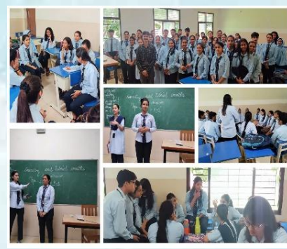
Group Discussion on the topic 'Real V/s Real- Where are we living?' - Counseling and Tutorial Committee