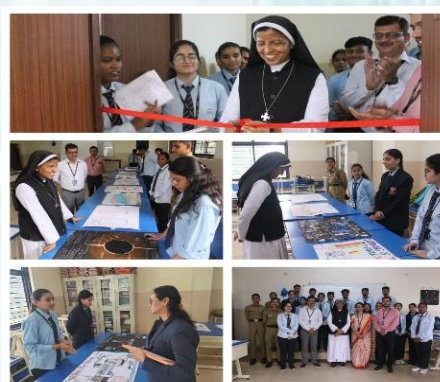
Poster exhibition cum Competition was conducted by the Department of Science