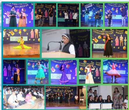
Programme Committee organized Inter-house cultural events - Day 1