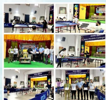
Participation at Division Level (Girls) Tennis Tournament at Govt. GDC College Indore