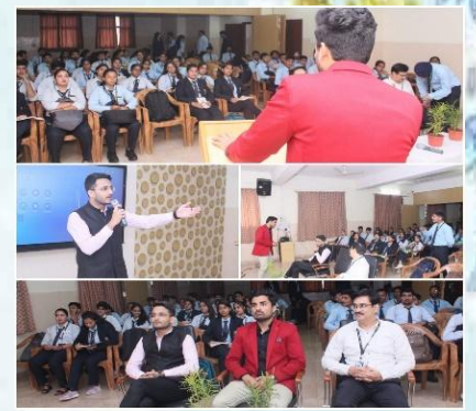
Department of Management organized an Alumni interaction session