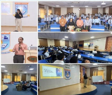
Career and Skills Development Committee conducted a session on Personality Grooming for upcoming managers