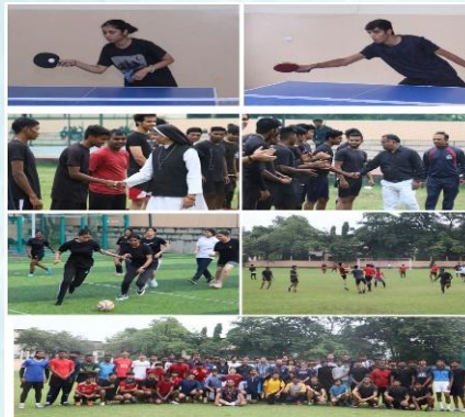
Sports Committee organized Inter-house Table Tennis and Football Tournaments