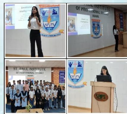
Counseling and Tutorial Committee organized a guest talk on 'Emotional Intelligence - The Key To Success In Early Adulthood'