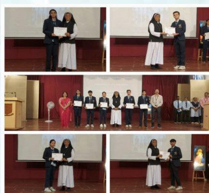
Felicitation of the winners of Commerce Quiz in morning assembly