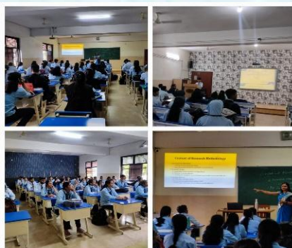
RM Workshop Module-1 was organized by the Research and Journal Committee