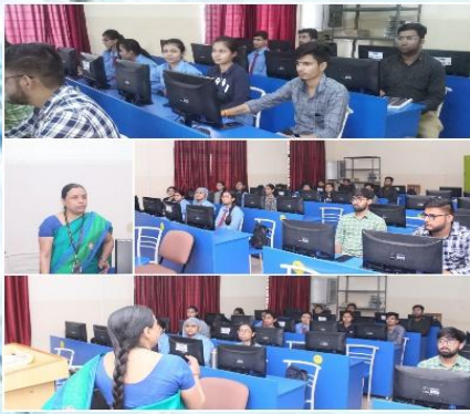
Digital library orientation by Library Committee for MBA I Year students