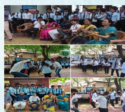
Music and Dance Club activity for BA, BSc and BCA Students