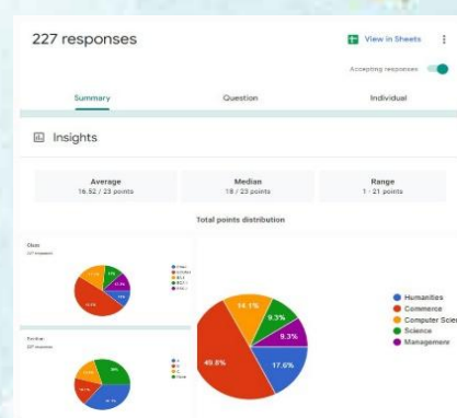
e-quiz based on Logical reasoning for I Year students - PUE Committee