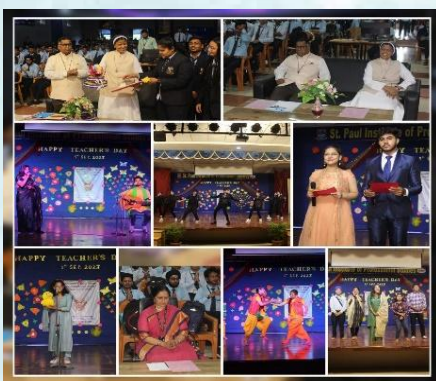
Programme Committee celebrated Feast Day of Sister Principal cum Freshers' Talent Show