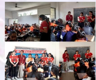
Gender Champions Club conducted Session on Women Yesterday Today and Tomorrow