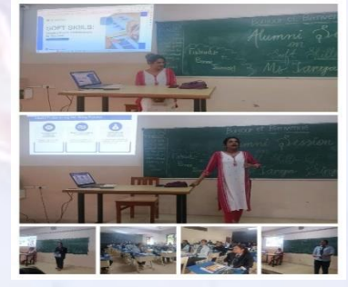
Alumni interaction by Department of Social Sciences - A