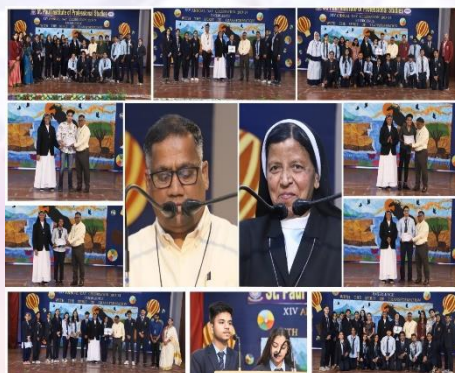
Thanks Giving cum Felicitation Ceremony for annual day participants - Programme Committee