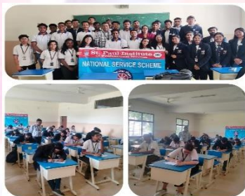
NSS Committee organized B - certificate NSS exams for II Yr. Volunteers