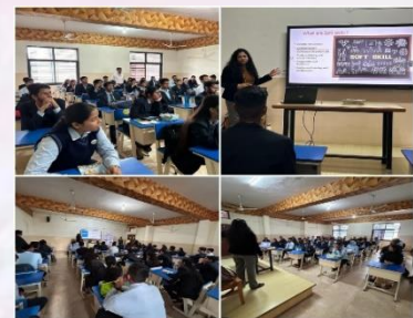
Session on Professional Etiquettes by Career and Skills development Committee