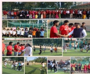
Sports Committee organized Inter Class Turf Football Tournament