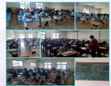
Pre-University Examinations for II- and III-year classes