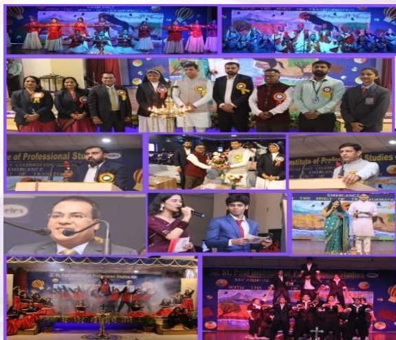
XIV Annual Day Celebration – Emergence Programme Committee