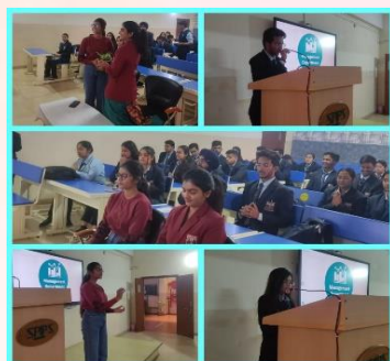
Dept. of Commerce and Management - B along with University Examination Committee organized an alumni interaction