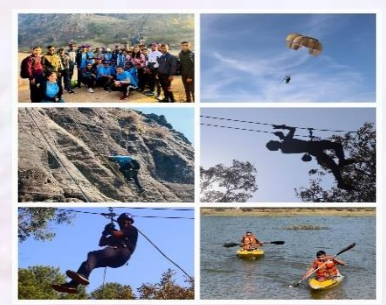
NCC Cadets participated in the International Adventure Camp held at Pachmarhi