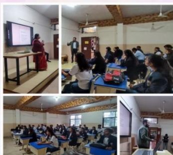
Expert talk on ICT enabled Tools by e-care Committee