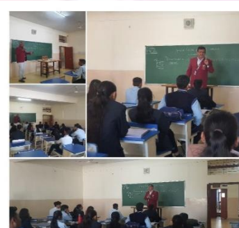
University Examination Committee conducted a special session for all advance learners of Department of Science and Computer science