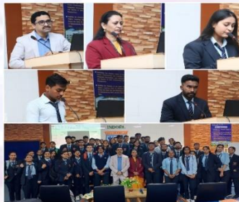
Department of Science and Computer Science-B organized a Guest lecture