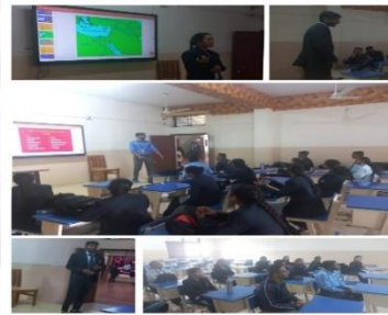
Students' led session on 'Bible at a Glance' – Christian Students Association