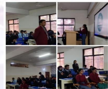
Dept. of Commerce & Management - B organized an Alumni Interaction Session