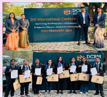
Research Paper presentation by faculty and students at the 3rd International Conference in Daly College of Business Management (DCBM), Indore