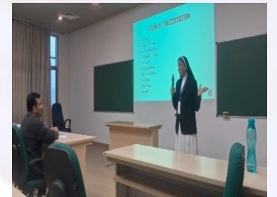
Principal presenting paper titled 'Exploring Impact of Ethics on Academic Performance in Higher Education' at XLRI, Jamshedpur