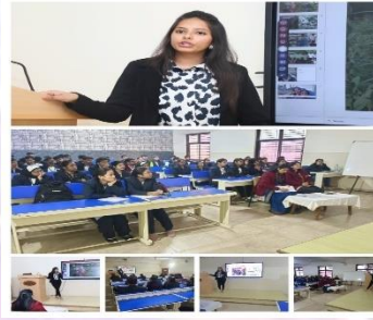
Environment Awareness Committee organized alumni interaction session