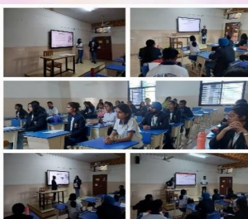
Research and Journal Committee conducted class-wise research paper abstract presentation