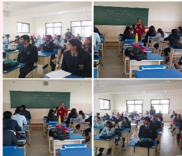
Language Lab Committee organized a Mock Test on English Language