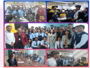
Industry Visit for BCA I, II, III Yr. students to Moreyeah IT Solutions