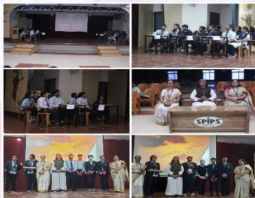
Department of Science & Computer Science - A conducted a WIZQUIZ on Basic of IT