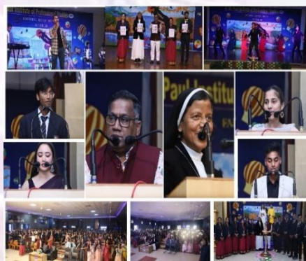
Farewell for the Batch 2021-24 - Programme Committee