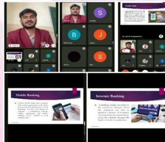
Financial Mastery Module - Department of Commerce and Management - A under MOU with Alphonsa College, Pala and St. Teresa's College, Ernakulam