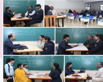
Class-wise Parents Professors Meeting '2024