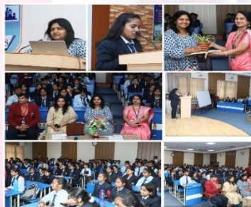
Department of Commerce and Management - A under banner of Institute of Chartered Accountant of India conducted a session on Union Budget Analysis and Career Counseling