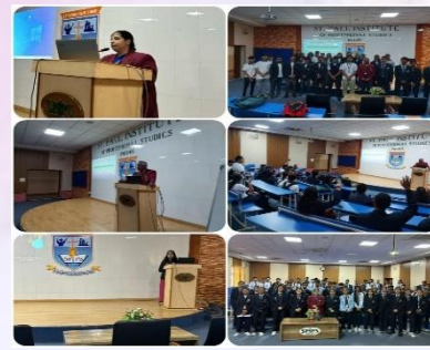
3 days' workshop on Internet Fundamentals and Effective Presentation Techniques - Research and Journal Committee