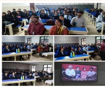
Documentary Presentation on Gender Sensitivity - Gender Champions Club