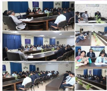
Meeting of Director and Principal with the Class Representatives and Student Coordinators of Student Welfare Committee