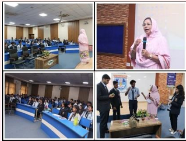
Counseling and Tutorial Committee organized a Guest Talk on soft skills